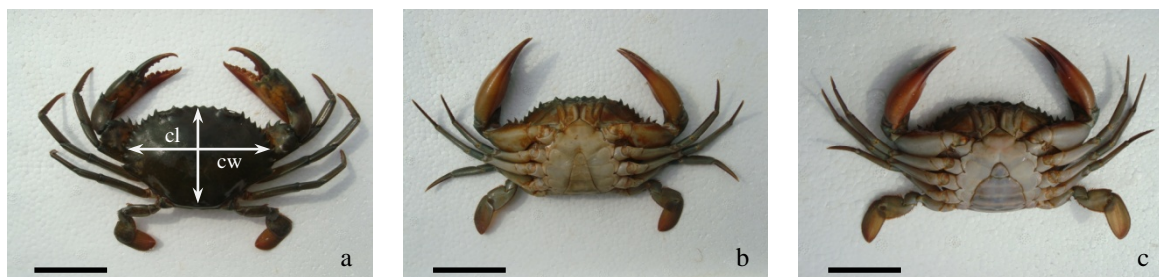
Figures 1 Scylla olivacea : a, dorsal view; b, male (ventral view); c, female (ventral view); scale bar: 5 cm.

Since there were five Octolasmis species previously recorded from portunid crabs in the northern Gulf of Thailand (see above), this study hence, was limited only in terms of population and interaction between parasites and their host including the distribution pattern.