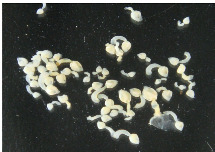
Figure 3 Pedunculate barnacles dislodged from gills.