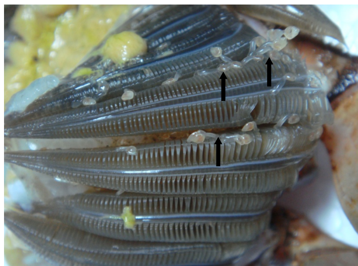
Figure 2 Gills infested with pedunculate barnacles (arrows).