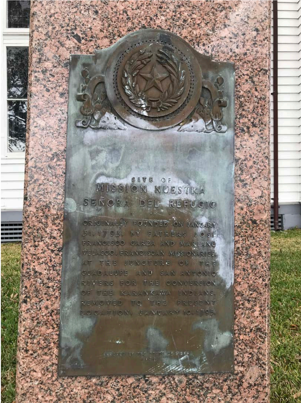
Photo 3: Detail view of bas-relief bronze plaque—camera facing north, February 15, 2018.