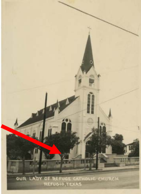
Figure 3: Second location of the mission monument, 1979.