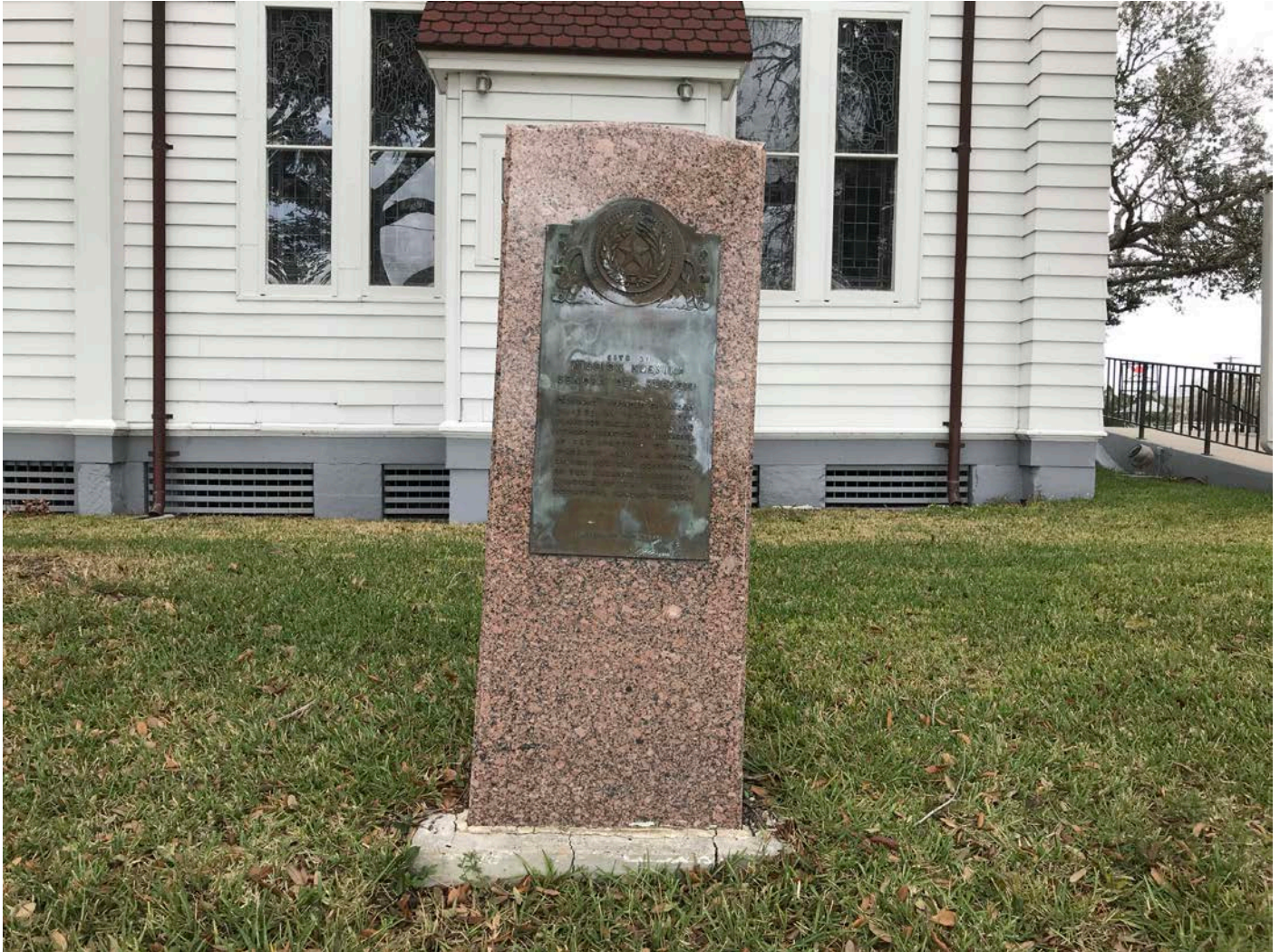
Photo 1: Mission Nuestra Señora del Refugio monument—camera facing north, February 15, 2018.