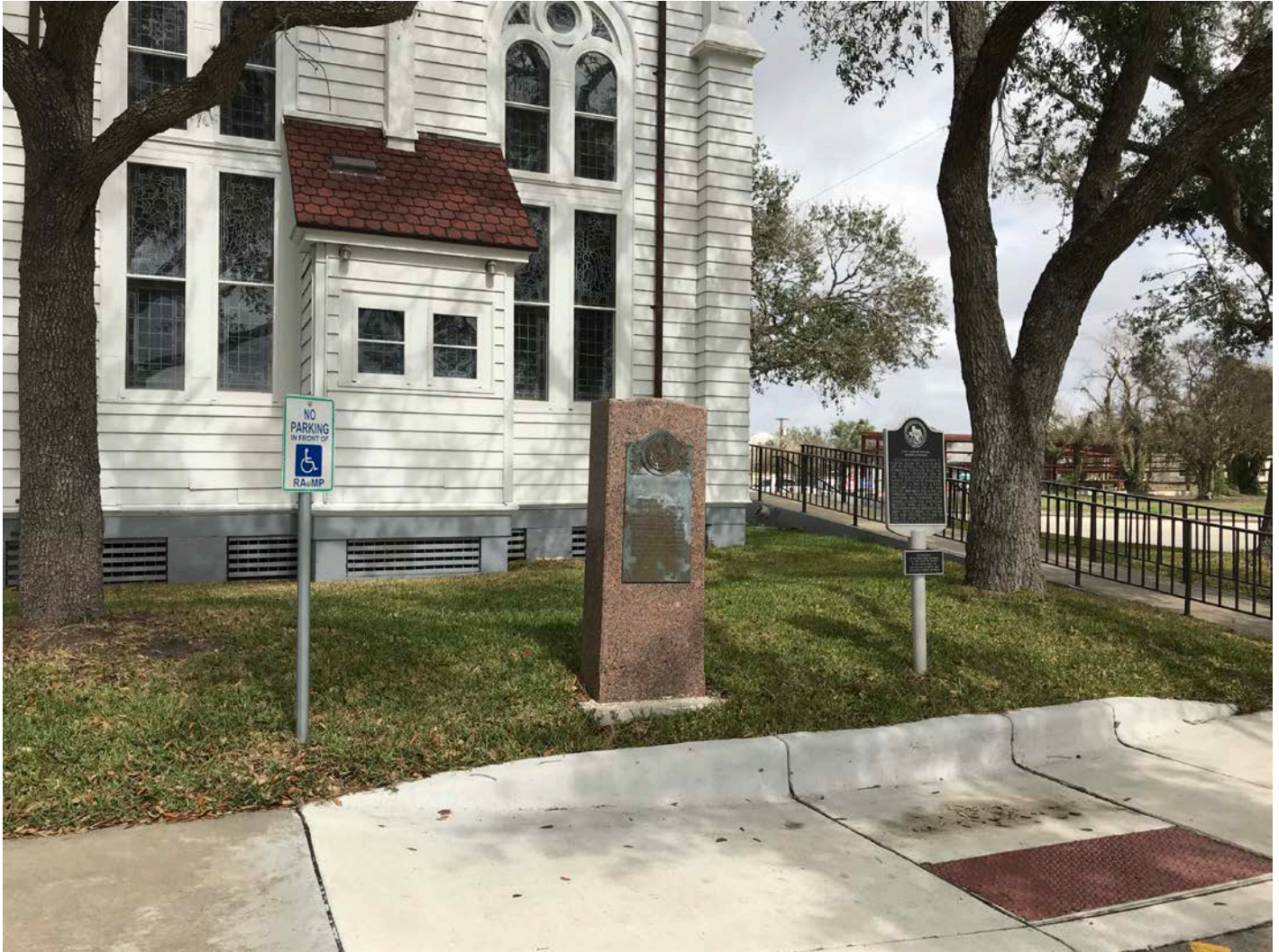
Photo 4: Mission Nuestra Señora del Refugio monument at the Our Lady of Refuge Church—camera facing north, February 15, 2018.