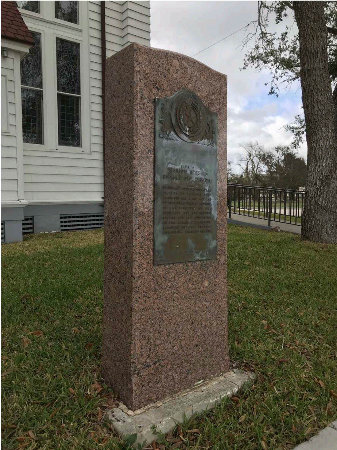
Photo 2: Monument oblique—camera facing northeast, February 15, 2018.