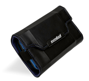
Magnetic Flap allows for quick closure