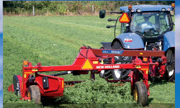
low rate financing available<sup>•</sup> Discbine 313R