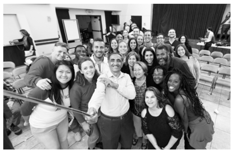
Photos: The 2018 Globe for All Tour production of A Midsummer Night's Dream. Photos by Rich Soublet II.