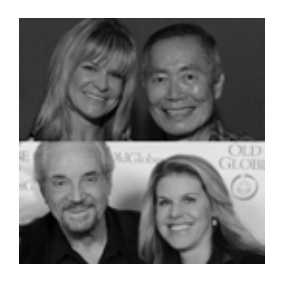
ELAINE LIPINSKY FAMILY FOUNDATION