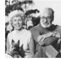
THE THEODOR AND AUDREY GEISEL FUND