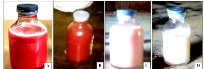
Fig 2: Changes in the colour of the milk in response to treatment A. Before treatment B. 3 rd day of treatment C. 4 th day of treatment D. 5 th day of treatment

@ 5 mg/kg BW, IV, SID, Inj. Adrenaline (5 mL mixed with 20 mL of normal saline), intramammary, SID and Bol. Serratiopeptidase @ 2 boluses, PO, BID for five days. No tangible improvement in the colour of the milk was noticed until 72 hours after initiation of therapy (Fig. 2A and B). Improvement in condition was noticed on the fourth day (Fig. 2C) and complete recovery was noticed after five days (Fig. 2D).