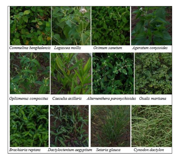
Fig 1: Weed dominance in research plots of soybean in 2016 and 2017