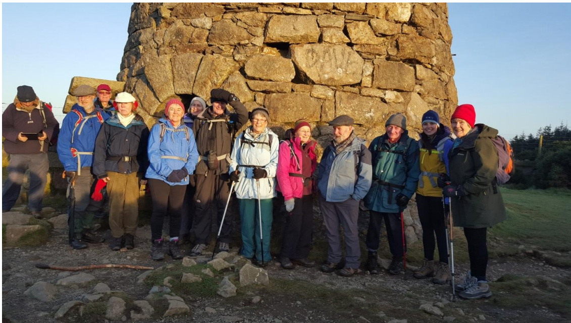
Members of the grades 3,4 and 5 at the Lead Mines Chimney on the Combine walk on St Stephen's Day.