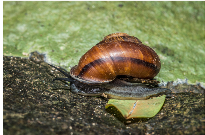
Figure 1. Photograph of a living adult Myxostoma petiverianum , taken on Hòn Cau, Vietnam.

Besides these, historical records of land snails from Côn Đảo archipelago (Martens, 1872) suggest no species are closely-related to Myxostoma petiverianum except Cyclophorus volvulus Müller, 1774. Yet, Cyclophorus volvulus can be easily distinguished from M. petiverianum by its shell, which has much thicker, dark brown spiral band below the periphery, an aperture that is orientated somewhat parallel to the coiling axis and a rather tall spire with sharp apex (Pfeiffer, 1846), none of which characterises the M. petiverianum individual in Figure 1.