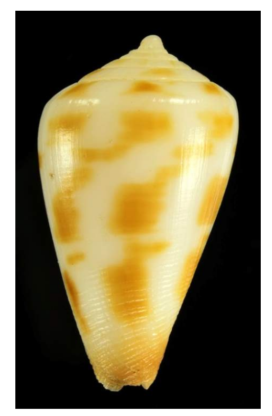
Figure 1. Floraconus (Sciteconus) mosterti R. Aiken, new species

forming an almost checker board pattern in some specimens. Base of shells purple-brown.