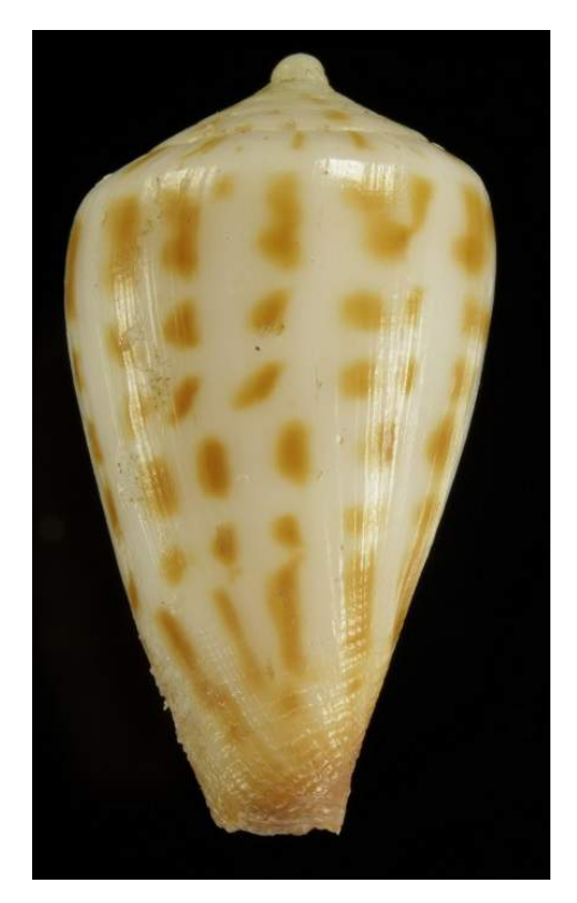
Figure 2. Floraconus (Sciteconus) markpagei R. Aiken, new species.

Distribution. Dredged at 100 metres between Port Alfred and Kenton-on-Sea, Eastern Cape Province, South Africa.