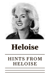
Heloise HINTS FROM HELOISE

Dear Heloise: After adopting my rescue dog last year, I noticed when buying her cushioned