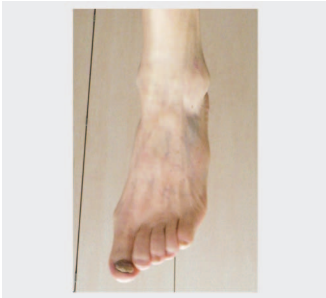
► Fig. 1 Buergers test: elevation for 30 seconds, pathological finding with noticeable pallor, loss of capillary refill, loss of venous filling.