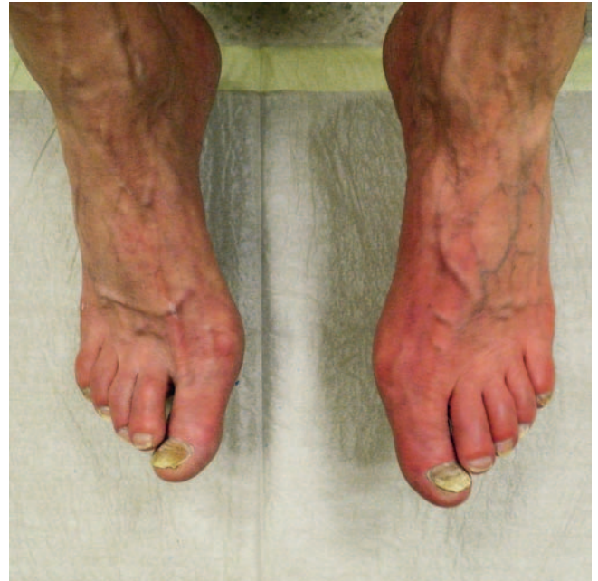
► Fig. 3 Buergers test: sitting for 30 seconds, pathological findings on the left with notable reactive hyperaemia (compared with the right side).

refill after pressure is applied briefly to blanch the tissues of the toe. However, when there is relevant ischaemia, a noticeable pallor can be seen after 30 seconds of elevation. In these cases, the vascular angle (Buerger's angle) can be determined. If the leg becomes pale at <20^\circ , there is critical ischaemia of the foot.