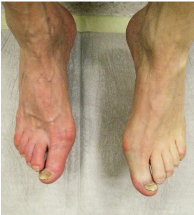
► Fig. 2 Buergers test: sitting for 10 seconds, pathological findings on the left with persistent pallor and delayed reperfusion (compared with the right side).

refill after pressure is applied briefly to blanch the tissues of the toe. However, when there is relevant ischaemia, a noticeable pallor can be seen after 30 seconds of elevation. In these cases, the vascular angle (Buerger's angle) can be determined. If the leg becomes pale at <20^\circ , there is critical ischaemia of the foot.