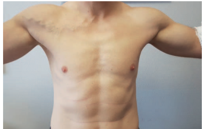
► Fig. 2 Typical clinical picture of a marked collateral circulation in a functional position.

the arm. The average age of onset is between 25 and 35 years of age. It affects men almost twice as frequently as women [10]. Depending on the severity of the condition, the symptoms may be positional or persistent. If the condition becomes chronic, a collateral circulation develops over the chest wall with time (► Fig. 2 ). Pulmonary embolism with dyspnoea and dizziness may also occur in up to 20% of cases [5].