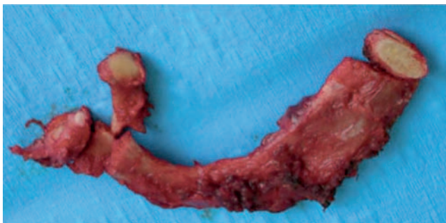
► Fig. 4 Resection of the 1st rib. All anatomical muscle and ligament variants that could potentially compress the vessels are removed, with the exception of the pectoralis minor muscle.

[8]. A return to unrestricted training or team training took 4–6 months (► Fig. 5 ). We have not so far had any complications or recurrent thrombosis in our patient population.