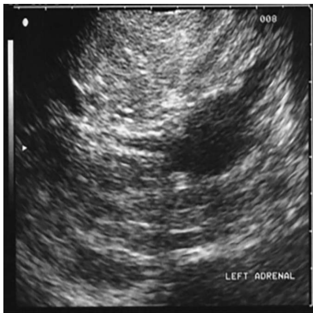
► Fig. 3 Hypoechoic lesion of the left adrenal.

Among all EUS adrenal lesion images, we identified a total of 58 lesions, corresponding to 38 patients, for inclusion in this study. Of these, 27 patients with 46 lesions were classified as bPCC, 4 patients with 5 lesions as mPCC, and 7 patients with 7 lesions as ACC.