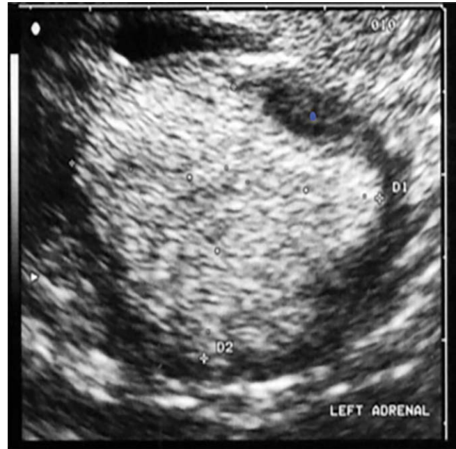
► Fig. 1 Hyperechoic lesion of the left adrenal.

Statistical analyses were performed using SPSS Version 23.0 (SPSS, Chicago, IL, USA). For descriptive statistics, results are presented as frequency (%) or mean \pm SD and range. P-values < 0.05, based on chi-square test, Fisher's exact test, and Mann-Whitney U test, were considered significant.