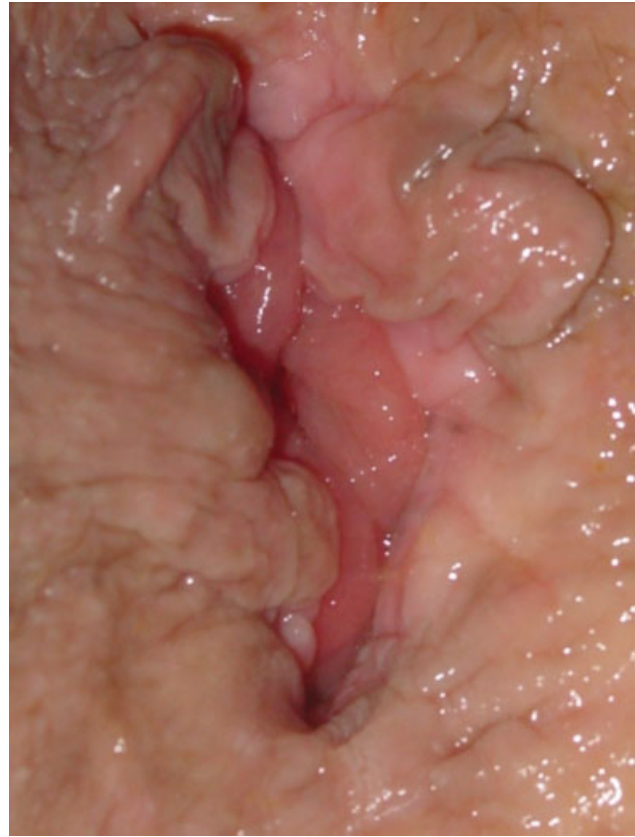
Fig. 5 The Whitehead deformity following hemorrhoid surgery exemplifies a surgical cause of pruritus ani diagnosed on physical examination.

Target lock on the perianal region should be avoided. Disease-specific conditions often affect the genital regions as