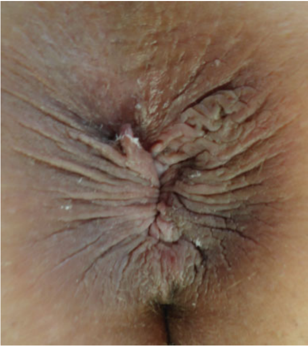
Fig. 4 Lichen simplex is the chronic presentation of pruritus ani. Thickening of the anal verge tissues and deepening of the rugal folds may be apparent as well as concentric superficial radial fissuring.

between insufficient versus aggressive or excessive practices. Documentation of alcohol, tobacco, and caffeine, and similar compounds is important. Other dietary factors should be considered including those that alter the pH of colorectal mucous or increase its delivery by flatulence.