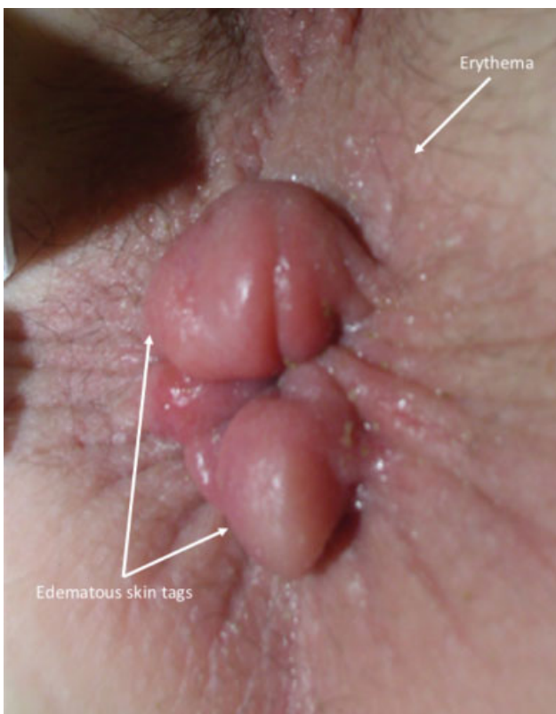
Fig. 7 Erythema and reactive edema in the perianal eczema

Perianal contact dermatitis may progress to create multiple vesicles, oozing, and erosion surrounding cutis ani. Itching is the main symptom and leads to the itch–scratch–lichenification cycle of perianal skin. Fingers and nails should be examined. Eczema can be found spread by the itch–scratch phenomenon over body's intertriginous zones and joints. Frequently, different areas may be affected simultaneously or sequentially as shown in ►Fig. 8. Lichenification is present in chronic eczema.