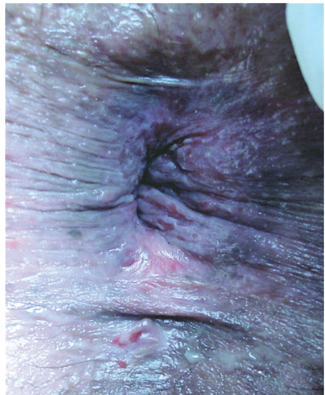
Fig. 3 Severely excoriated and macerated tissues are evident within the anal margin representative of one extreme of the itch–scratch cycle.

simplex. The tissues within the anal margin are thickened and the rugal folds are deeper and/or superficial fissuring (radial cracks) of the skin may be apparent in this setting (→ Fig. 4 ). Frank ulceration of the skin is more concerning and requires definitive diagnosis with biopsy and pathologic confirmation.