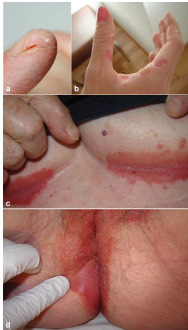
Fig. 8 Synchronous body itch–scratch–lichenification cycle in case of chronic dermatitis involving (a) nails, (b) fingers, (c) inframammary folds, and (d) perianal region.