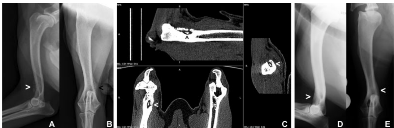
Fig. 4 Case 3: (A) Mediolateral and (B) craniocaudal preoperative radiographs of the right humerus showing irregular palisading periosteal reaction on the craniomedial aspect (arrowheads) of the distal humerus. (C) Multiplanar computed tomography reconstructions (three orthogonal views) of the distal humerus showing a bony sequestrum partially surrounded by involucrum (arrowheads). The draining cloaca is also visible. (D) Mediolateral and (E) craniocaudal radiographs of the right humerus taken 6 weeks after sequestrectomy showing smooth homogeneous periosteal remodelling of the distal humerus (arrowheads) consistent with osteomyelitis resolution.

Culture of the sequestrum identified a pure growth of Pasteurella sp. , susceptible to a variety of antibiotic medications, including cephalexin and amoxicillin-clavulanate. The dog was maintained on amoxicillin-clavulanate until re-examination at 6 weeks to ensure resolution of the osteomyelitis. The re-examination revealed complete resolution of lameness, reportedly within days of surgery and uncomplicated wound healing. There was no pain on firm palpation of the distal humerus and radiography revealed resolution of the aggressive bony lesion and smooth remodelling of the cortex (►Fig. 4D, E). At this time, antibiotic medications were stopped and light exercise was resumed with unrestricted work allowed from 10 weeks postoperatively. No further problems were reported over the following 2 years.