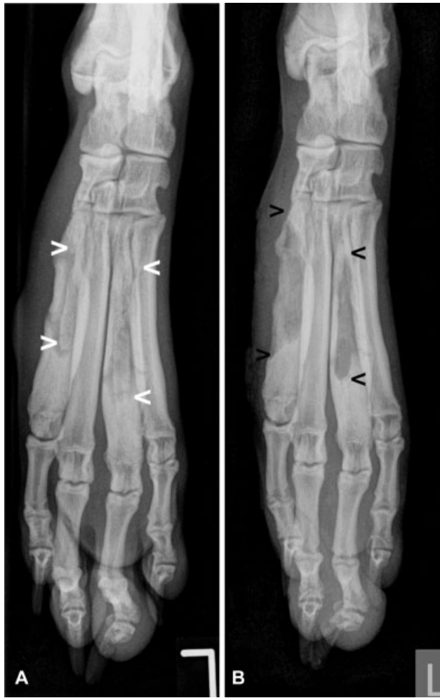
Fig. 1 Dorsoplantar radiographs of case 1. (A) Preoperative view showing bone fragments within the medullary cavity of the second and fourth metatarsal bones (arrowheads). On the medial aspect of the second metatarsal is a focal cortical defect visible, consistent with cloaca formation. (B) Immediate postoperative view, confirming complete sequestrectomy.

medially and dorsally. Aspirates from the popliteal lymph node were consistent with reactive hyperplasia, and a diagnosis of osteomyelitis with sequestration was made.