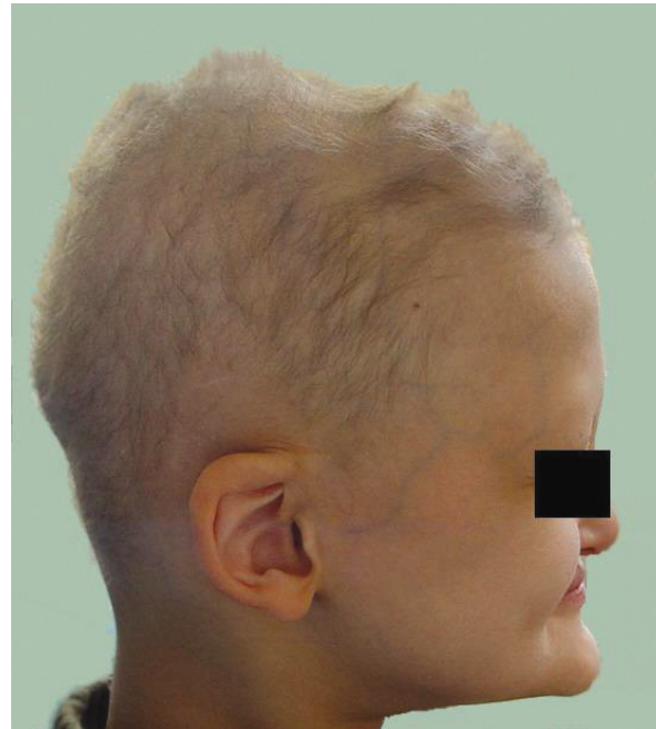
Figure 2. Profile view of the patient.