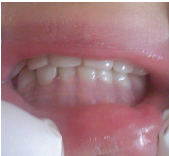
Figure 15. Intraoral view after treatment.

In case 2, early prosthetic treatment led to significant improvements in appearance, speech, and masticatory function. During the first month following the initiation of prosthetic treatment, it was difficult for the 3-year old patient to adapt to the complete dentures; however, he was accustomed to using the dentures and was able to eat adequately within a few months. Although dentures are poor alternatives to healthy dentition,