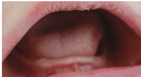
Figure 4. Intraoral view of the lower jaw.