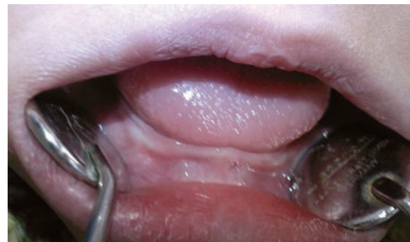
Figure 11. Intraoral view of the lower jaw.