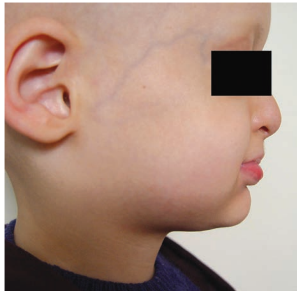
Figure 9. Profile view of the patient.