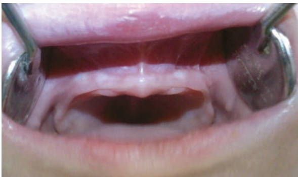
Figure 10. Intraoral view of the upper jaw.