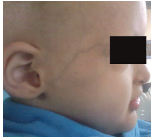
Figure 14. Profile view after treatment.