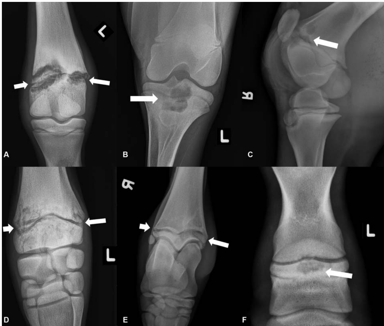
Fig. 1 Radiographic examples of septic physisitis in foals in varying anatomical physes with a brief description of the physal lesions (arrows are pointing the abnormal lesions). (A) Dorsoplantar projection, distal third metatarsus (severe extensive lysis throughout the physis that extends into the metaphysis and epiphysis), 1-month-old Thoroughbred colt; (B) craniocaudal projection, proximal tibia (severe focal lysis centred on the mid physis that extends into the metaphysis and physes), 1-month-old Pony of America filly; (C) lateromedial projection, distal femur (variable mild to moderate focal lysis in the cranial physis that extends into the metaphysis and epiphysis), 3-week-old Thoroughbred colt; (D) dorsopalmar projection, distal radius (variable mild to moderate ill-defined lysis throughout the physis that extends into the metaphysis and epiphysis), 2-week-old Thoroughbred filly; (E) dorsoplantar projection, distal tibia (variable mild lysis throughout the physis, worse medially, that extends into the metaphysis and epiphysis), 2-week-old Quarter Horse colt; (F) dorsopalmar projection, proximal middle phalanx (moderate focal lysis centred region of the mid physis that extends into the metaphysis and epiphysis), 3-month-old Thoroughbred colt.

but distant from the region of septic physisitis. Synovial fluid obtained from the affected synovial structures was seroanguineous and/or turbid in all affected cases. Culture of synovial fluid was submitted in four of eight foals, with positive growth ascertained in one case ( Streptococcus zooepidemicus ). Non-musculoskeletal systemic co-morbidities were present in 4 of 10 foals, with two having clinical symptoms of colitis/diarrhoea, one having pneumonia and other having an umbilical abscess confirmed on ultrasonography and resected at surgery.