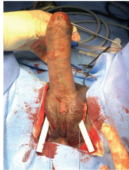
Fig. 1 Malleable penile prosthesis in position prior to proximal ends being trimmed.

Incisions to place the prosthesis can be made ventrally such as an infrapubic incision or dorso-inferiorly such as a parascrotal incision. Surgeons implanting a penile prosthesis after phalloplasty should be conscious of the vascularity of the flap and minimize compromise of this when deciding the location of the incision. For example, the MLD phalloplasty will utilize a flap that requires an anastomosis to the unilateral superficial femoral artery and saphenous vein. 10 Incisions on this side should be avoided when placing the prosthesis. Abdominal phalloplasty is usually based on the superior lateral blood supply to the neophallus. Consideration should be made for an inferior or inferior lateral incision. 11 If the vascularity cannot be determined preoperatively, a Doppler ultrasound can assess the location of the primary vessels. The neophallus may develop accessory