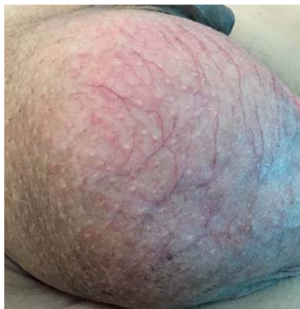
Fig. 1 Enlarged scrotum following endoscopic retrograde cholangiopancreatography.

The incidence of duodenal perforation after endoscopic retrograde cholangiopancreatography (ERCP) is lower than 1%. When it does occur, intestinal gas usually tracks upward through the retroperitoneal space and mediastinum to present as surgical emphysema in the neck [1]. We describe a rare case of a young man developing pneumoscrotum following an ERCP-related duodenal perforation.