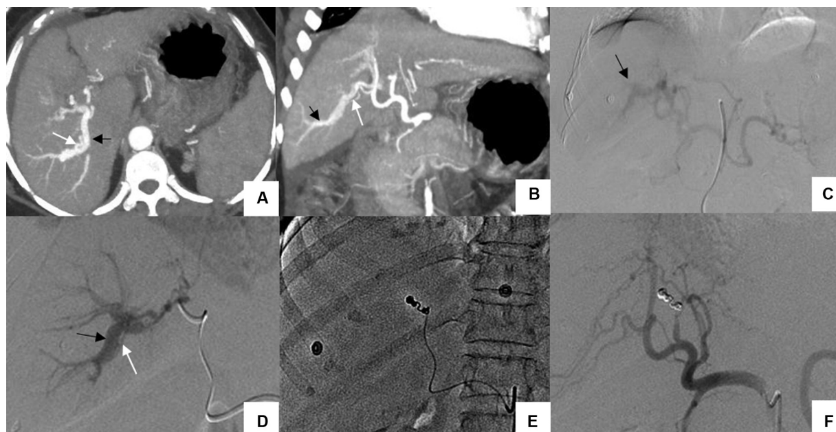
Fig. 1 Arteriportal fistula (APF) in a 56-year-old patient who presented with hemobilia. Computed tomography arterial phase images, (A, axial); (B, coronal), demonstrate an APF between the posterior segmental branch of the right hepatic artery (white arrow) and right branch of the portal vein (black arrow). Selective celiac artery angiogram (C) shows early peripheral opacification of portal vein branch (black arrow). A selective arterial angiogram (D) reveals an APF between the right hepatic artery branch (white arrow) and dilated branch of the right portal vein (black). Selective coil embolization of the arterial branch (E). Check angiogram (F) shows no opacification of the hepatic artery branch and APF.

venous opacification in the arterial phase suggesting an APF, without any obvious biliary communication, pseudoaneurysm, or hematoma (►Fig. 1A, B). Digital subtraction angiography confirmed fistulous communication between the posterior segmental branch of the right HA and PV (►Fig. 1C, D). The hepatic arterial branch supplying the fistula was super selectively cannulated using a microcatheter (PRO-GREAT, Terumo, Tokyo, Japan) and embolized using a pushable microcoil (18–14–4, MicroNester, Cook Medical) (►Fig. 1E). Thereafter, the coil scaffold was supported by n -butyl cyanoacrylate ( n -BCA) glue–Lipiodol mixture (0.3 mL, 30%), resulting in complete occlusion of the fistulous communication (►Fig. 1F). She had mild sepsis for which she was managed in the intensive care unit. There was no further melena or drop in hemoglobin.