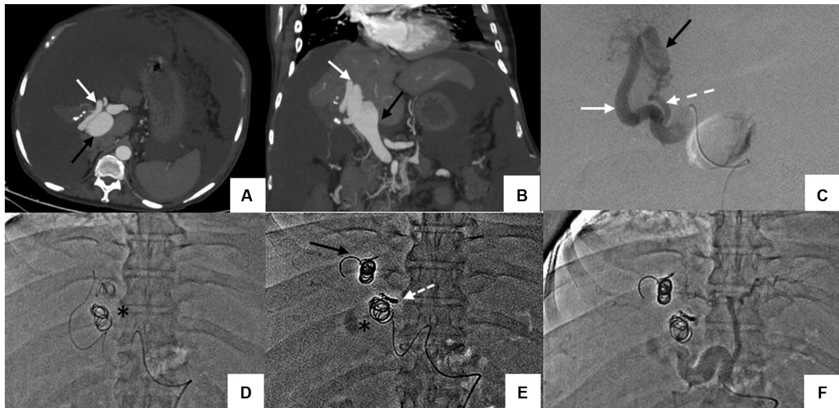
Fig. 2 Arteriportal fistula (APF) in a 50-year-old with APF and coil migration during angioembolization. Computed tomography arterial phase images, (A, axial); (B, coronal), demonstrate hypertrophied right hepatic artery (HA; white arrow) and early aneurysmally dilated right branch of the portal vein (PV) (black arrow) suggestive of an APF. Selective right HA angiogram (C) shows two arterial feeders (solid and dashed white arrow) and early opacified dilated PV branch. During coil placement (D) initial three coils migrated into the portal vein (asterisk). Post coil embolization (E) spot shows embolized larger and smaller feeder with migrated coil mass in PV (asterisk). Check angiogram (F) reveals nonopacification of the APF.

thrombus. During the 6-month follow-up, his abdominal distension has gradually resolved and there were no further episodes of hematemesis or melena. On follow-up imaging, the migrated coils were confined to the right PV with a non-occlusive eccentric thrombus of right PV.