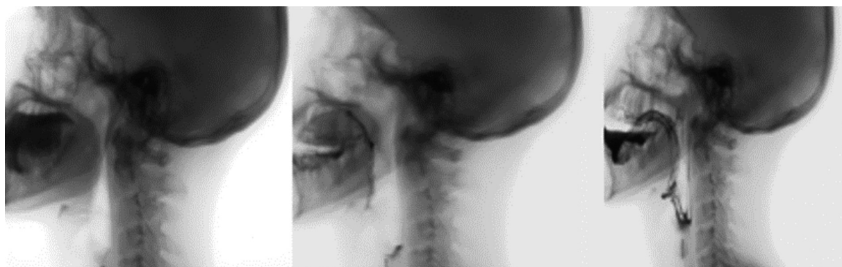
Fig. 2 X-ray of swallowing function.

The exact mechanism leading to thyrotoxic myopathy is not fully understood but it is likely that thyroid receptor antibodies play a role as well as direct action of increased levels of thyroid hormone on the muscle fiber's mitochondria