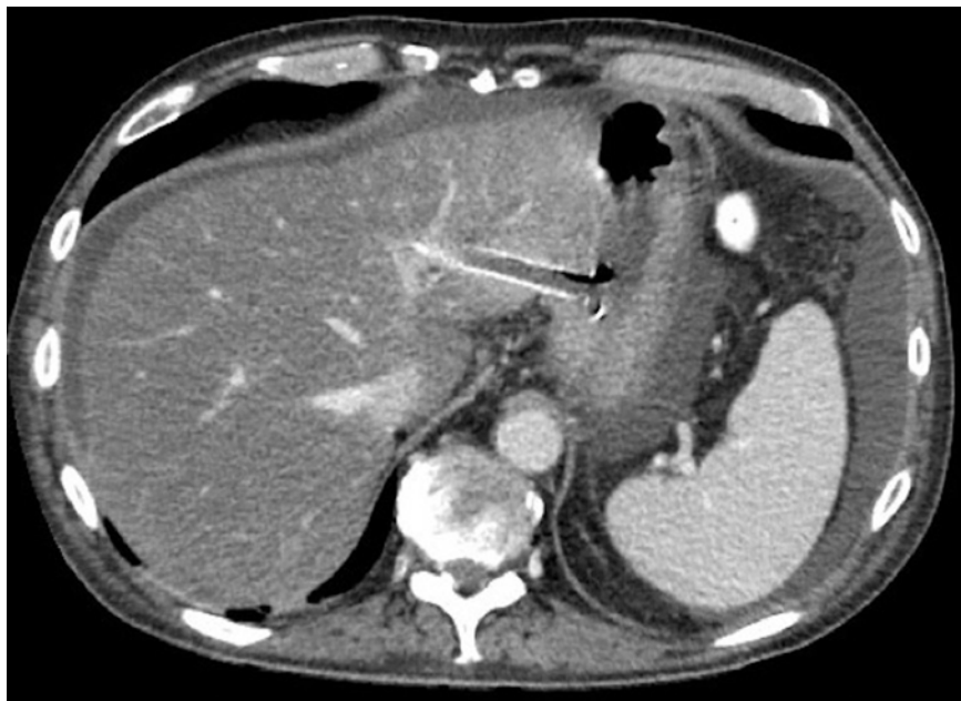
► Fig. 3 Computed tomography (CT) scan performed to confirm correct positioning of the stent.

3 Department of gastro and acute surgery, Haukeland University Hospital, Bergen, Norway