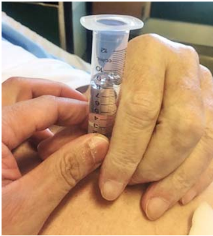
► Fig. 2 Photograph showing decompression of the air with a water lock.

parenchyma. A 10-cm partially covered dedicated HGS stent (Biliary Flange Lasso; M.I. Tech, Seoul, South Korea) was placed into the liver hilum; however, the stent was released erroneously into the peritoneum (► Fig. 1 a ), causing bile leakage.