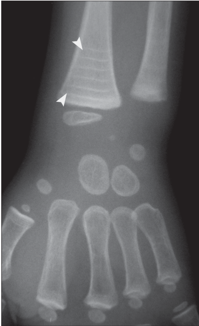
Figure 3: Posteroanterior radiograph of the wrist shows zebra lines (white arrow heads)

Faint metaphyseal lines seen in untreated children are called growth recovery lines. Transverse bands are also noted in heavy metal intoxication (lead), treated leukemia, healing rickets and chronic anemia; however, the sclerosis is not generalized and is more marked in the diaphysis. [1] In these situations, there is a period of growth suppression and subsequent recovery, which, if repetitive, results in multiple growth arrest lines. [6]