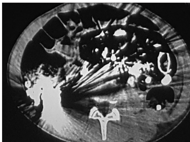
Figure 2: Computed tomography scan of the abdomen confirming the findings of the plain film and excluding other pathology