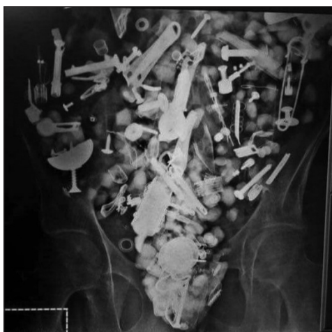
Figure 1: Erect abdominal plain X-ray huge number of radio-opaque objects with characteristic shapes of domestic materials

The highest incidence of bezoars cases is recorded in the stomach for their inability to pass through the pyloric sphincter. Hence, it is less frequent for bezoars to reach the small bowel. [8] Rapunzel syndrome is the term given for gastric trichobezoar “hairball” that has a tail-like extension into the small intestine through the pylorus causing gastric outlet obstruction. [5] Primary colonic bezoars are extremely rare. Very few reports of primary colonic bezoar causing large-bowel obstruction. [9] A primary colonic bezoar in which trichobezoars were obstructing the sigmoid colon and radiographs showed obstruction with no evidence for the cause. Hence, laparotomy was needed for the diagnosis and treatment. [10] Another case of primary colonic obstruction was due to a cloth fiber bezoar obstructing the left colon, it was also not diagnosed by radiographs alone and thus required surgery. [11] Conventional abdominal radiographs are usually enough to detect bowel obstruction; however, it is difficult to reach a definite diagnose regarding the cause of obstruction on plain radiographs alone. Reportedly, plain radiography could identify bezoars in only 10% of patients. [10,11] Fortunately, our case was promptly diagnosed with plain radiograph. Computed tomography scan was further performed to gather extra details for surgery.