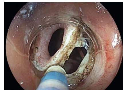
► Fig. 1 Fistulous orifice with necrotic cavity between the posterior wall of the bladder and the anterior wall of the rectum at 4 cm from the anal margin.

The authors declare that they have no conflict of interest