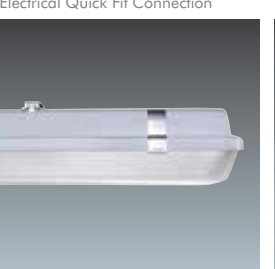
Captive stainless steel toggles