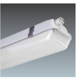
Electrical Quick Fit Connection