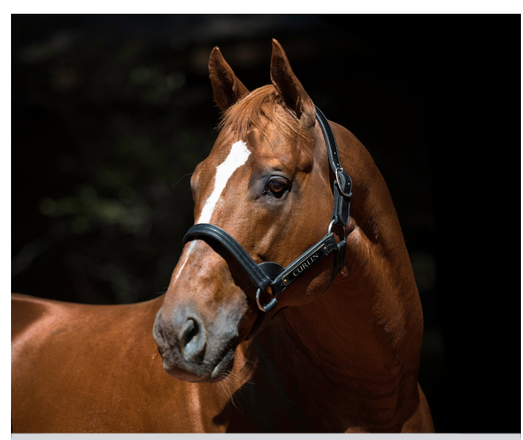
Serving the Thoroughbred Industry Since 1979