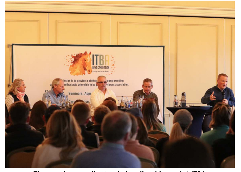
The panel was well-attended earlier this week

A National Hunt Panel Discussion was held by the Irish Thoroughbred Breeders' Association Next Generation this week at Tattersalls Ireland following the inspection day of the May Store Sale.