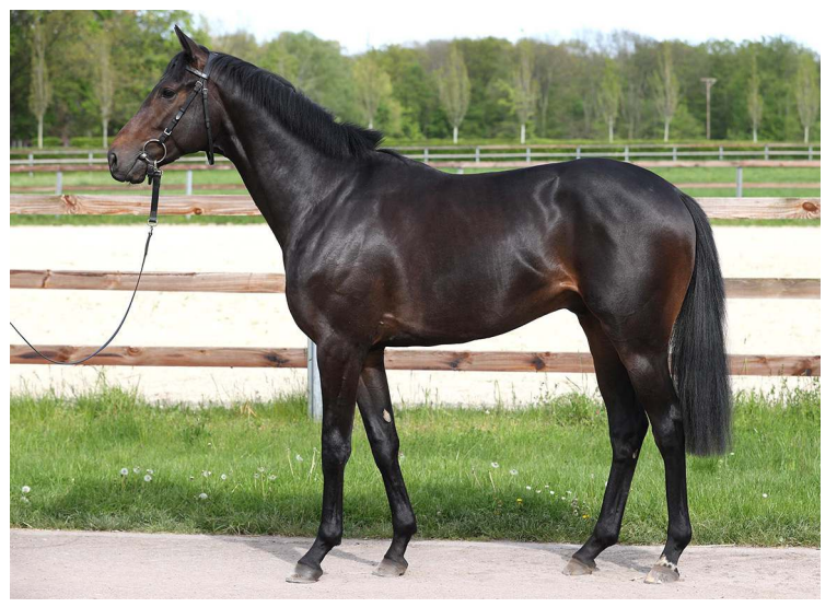
Meer, a son of Sea The Stars and G2 Diana-Trial winner Meergorl

The European breeze-up action moves to Germany this week with the breeze session of the BBAG Spring Sale set to take place on Thursday morning before the auction on Friday.