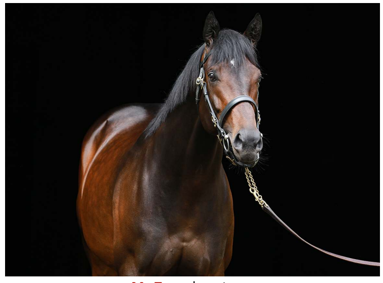
Mo Town

Good Samaritan (Harlan's Holiday), WinStar Farm, $7,500 172 foals of racing age/36 winners/1 black-type winner 1-Presque Isle Downs, 3:00 p.m. EDT, Msw 5 1/2f, He's a Good Dancer, 5-2 $15,000 RNA KEE JAN wnl; $75,000 OBS MAR 2yo