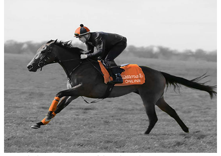
The breeze-up portion of the online sale is a new concept Tattersalls Online