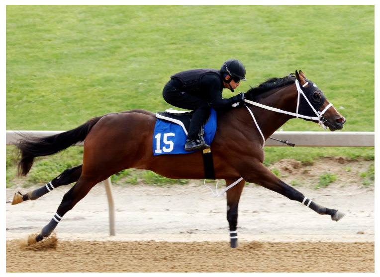
Hip 15 | Fasig-Tipton

"I think buyers like it because they race on dirt predominately," McCrocklin explained. "I think it gives them a little more confidence. You saw from the times today, it takes a very fast horse to go:10 flat here. Where at OBS on the synthetic racetrack, it's not unusual to see :10 flats all over the place."