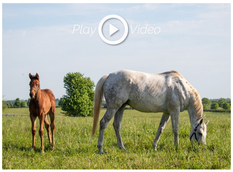
Click here for our visit with Pretty City Dancer, the dam of Kentucky Oaks winner Pretty Mischievous, and Godolphin's other two latest Grade I-producing broodmares

"...or Cody's Wish last year at the GI Breeders' Cup, but to have a domestic triple Grade I weekend, I don't think we've done that before," he said. "Obviously we've had a couple of great Breeders' Cups, but that was on the coattails of our English colleagues who helped us out big time. For us to do it here domestically, it was an amazing weekend and it meant so much to the team all across the board. Our expectations were pretty high, but we know the way the game goes. It couldn't have gone any more perfect."