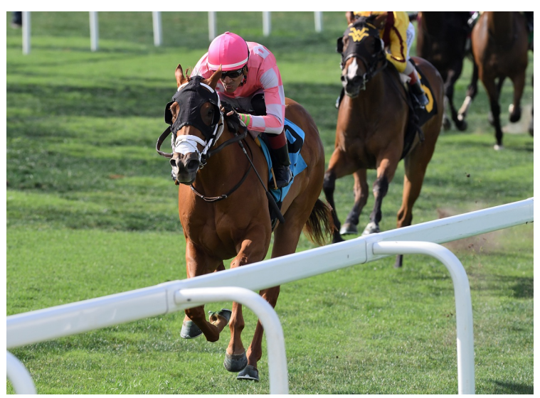
Crimson Advocate winning the Royal Palm Juvenile Fillies S. at Gulfstream Park