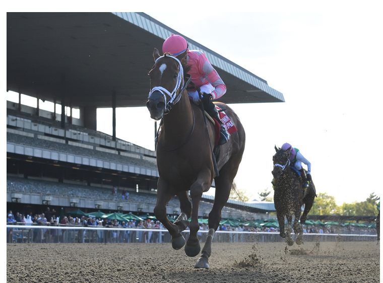
Pass the Champagne's Ruffian