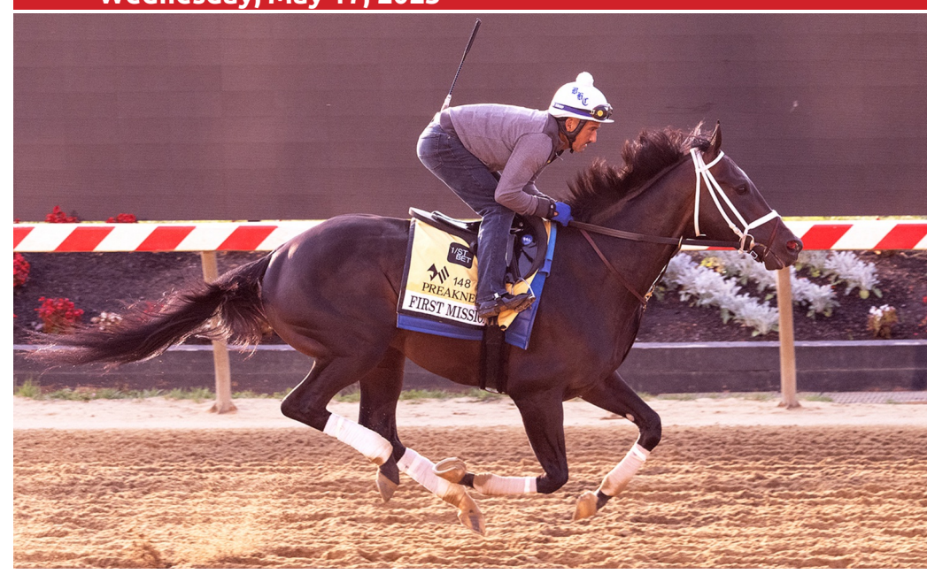
Godolphin's First Mission (Street Sense), second choice on the GI Preakness S. morning line, gallops at Pimlico Tuesday morning.