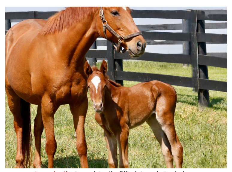
Daredevil--Casual Smile filly

Foal born Apr. 24, a filly by Daredevil. Owned by and boarded at Lane's End. Accomplishments: GSW of $151,845.