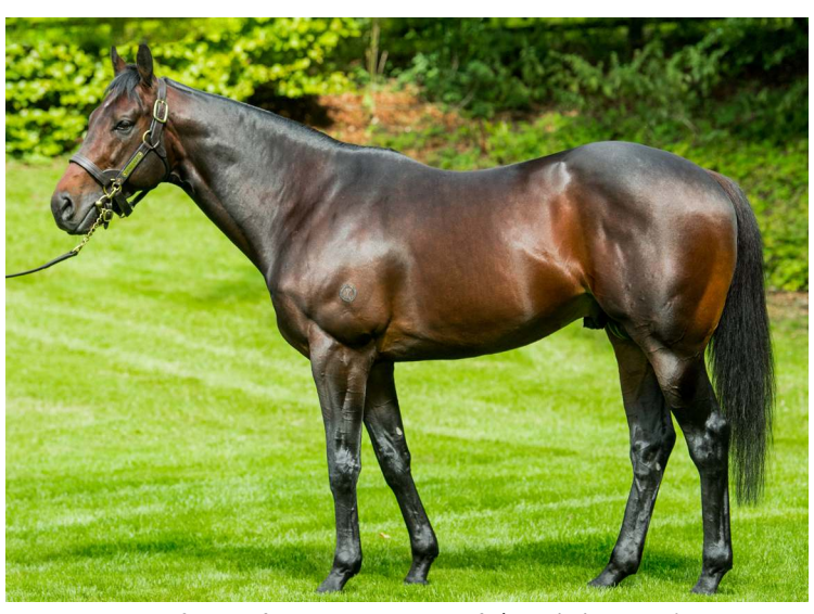
Land Force has a runner at York | Highclere Stud

30,000gns Tattersalls Somerville Yearling Sale 2022