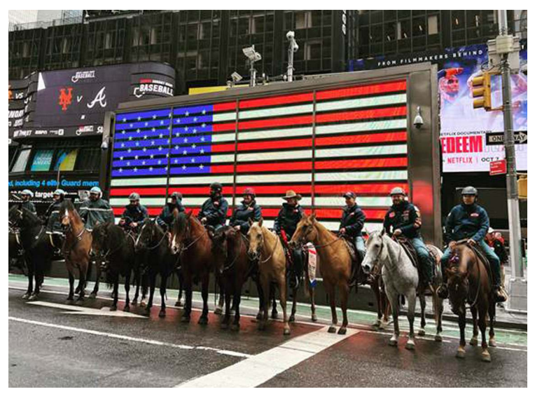
BraveHearts' Trail to Zero in Time Square in NYC, NY during ride in October 2022