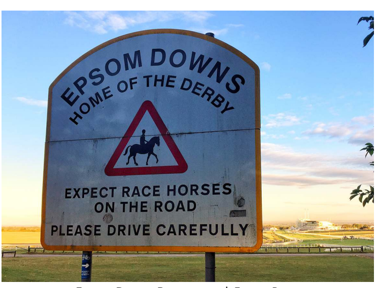
Epsom Downs Racecourse

An announcement from The Jockey Club states that the injunction would not hinder the right of anyone to protest peacefully, and that is has offered Animal Rising an area near the entrance of the racecourse specifically for this purpose on