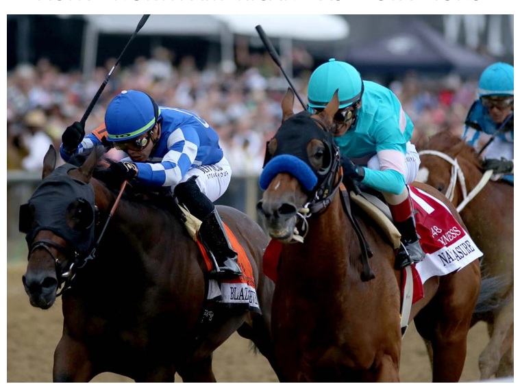
National Treasure (right) became the 15th elite-level winner for Quality Road in the GI Preakness S.