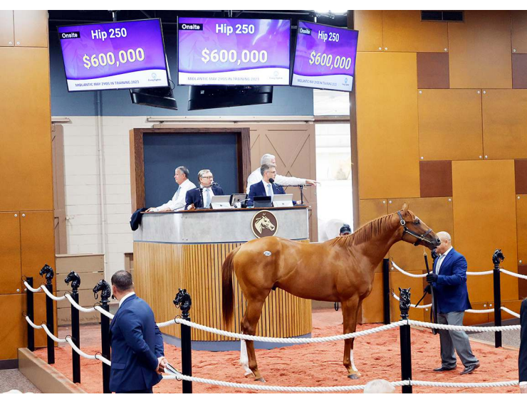
Hip 250, a colt by Tapit