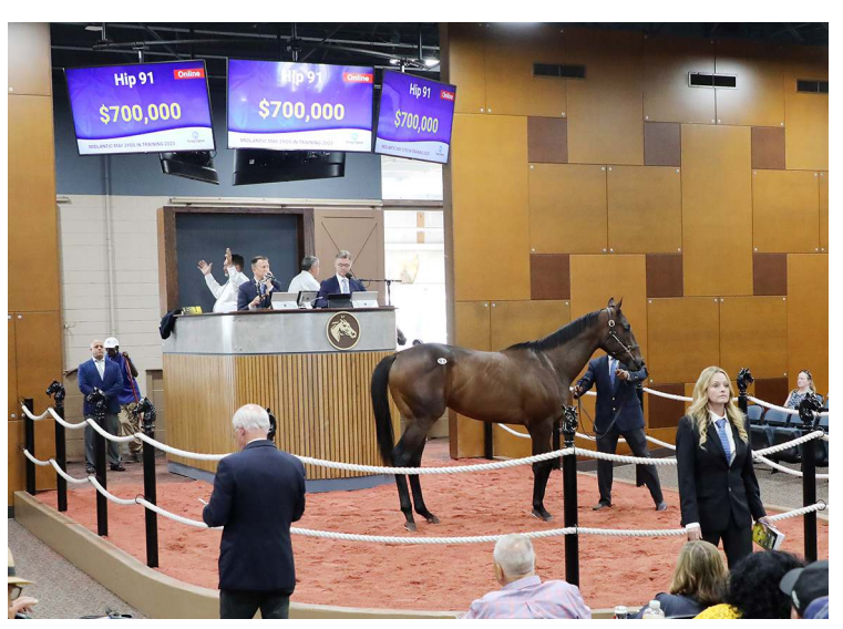
Hip 91 | Fasig-Tipton