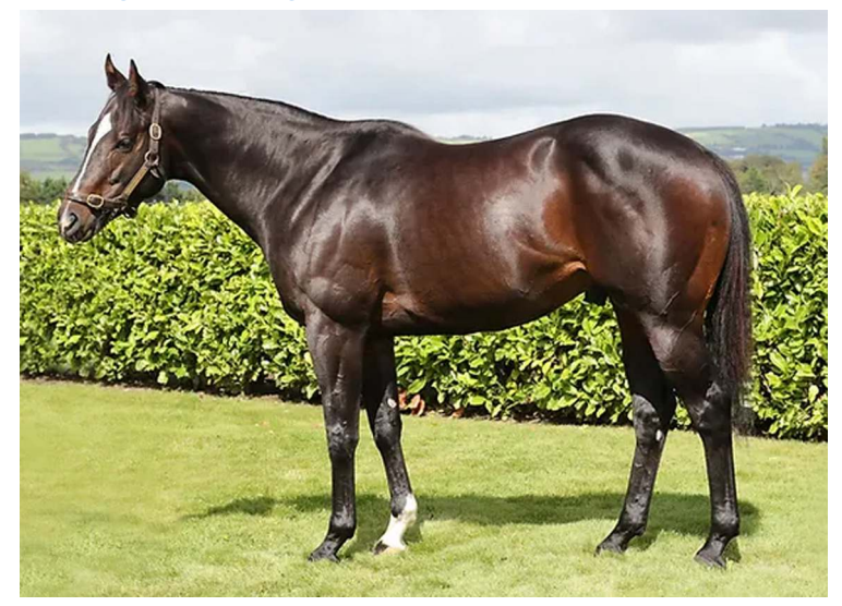
Soldier's Call is now the sire of eight winners | Ballyhane Stud

Ballyhane Stud's Soldier's Call (GB) is the latest of the young stallions to be zipping up the charts. In what seems like no time at all, he's gone straight to the top when it comes to number of winners, with a smart Saturday double bringing that tally to eight.