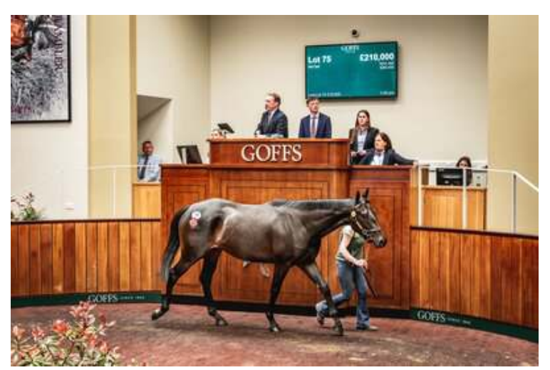
Lot 75 | Goffs UK