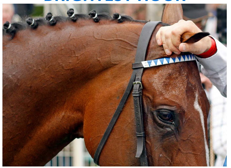
The Foxes is another Classic contender for Churchill