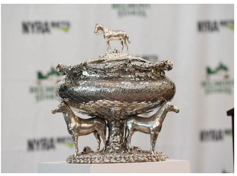
Belmont Stakes trophy

During the three-day Belmont Stakes Racing Festival, horses placed fourth through last in stakes races and horses placed second through last in non-stake races, will receive a starter bonus as set forth here for each eligible starter as part of the "Starter Bonus Program."