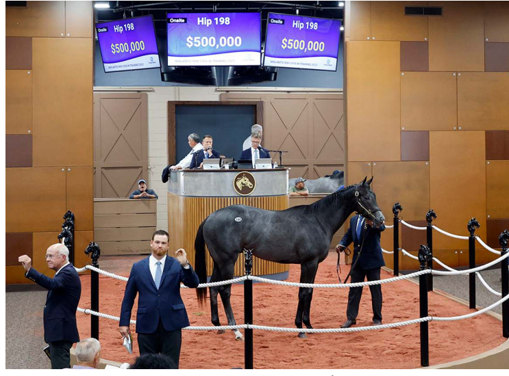
Hip 198, a colt by Not This Time