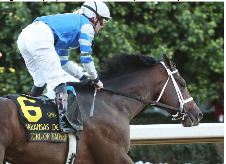
Angel of Empire