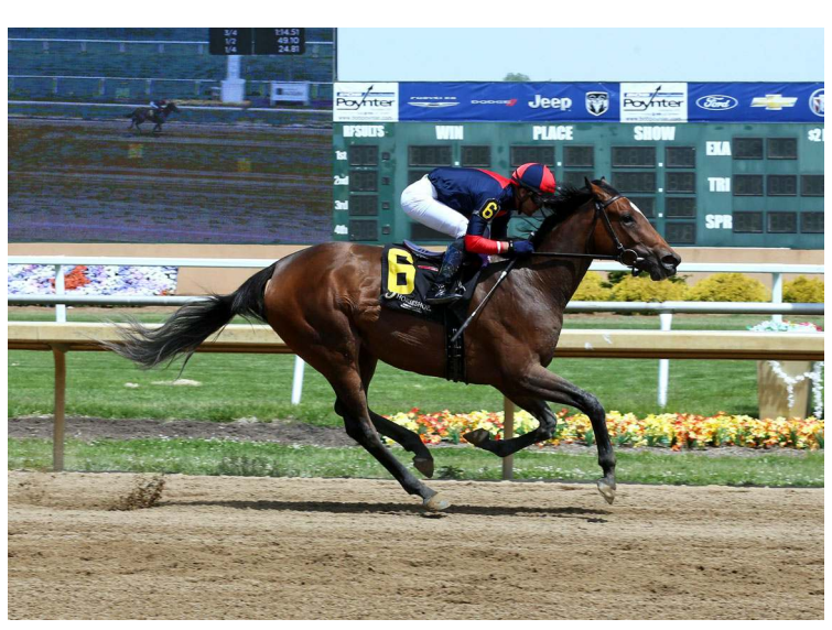
Active Lane (Tonalist) wins at Horseshoe Indiana

Yockey's Warrior , Sono, g, 3, o/o Seaside Candy, by Twirling Candy. ALW, 5-22, Louisiana Downs