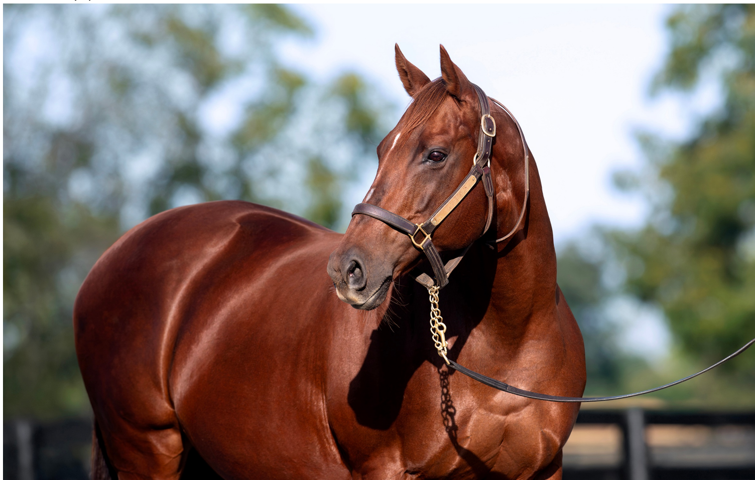
To celebrate the 40th running of the Breeders' Cup, the TDN will share a photo and catch up with a past winner in each of the 40 days leading up to the event. Today, we have two-time Filly & Mare Sprint winner Groupie Doll.