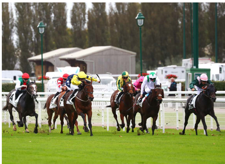
Zorken | Scoop Dyga

PRIX VULCAIN-Listed , €55,000, Deauville, 10-19, 3yo, 12 1/2fT, 2:42.80, sf.