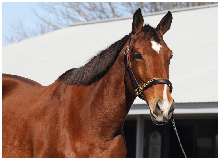
Ack Naughty | Keeneland

Keeneland has supplemented four horses, including Ack Naughty to Book 1 of the 80th November Breeding Stock Sale on Wednesday, Nov. 8 at 1 p.m. ET, and has added eight supplements to the November Horses of Racing Age Sale, which begins at noon Nov. 17, the sales organization said in a release Thursday.