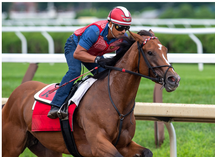
Played Hard