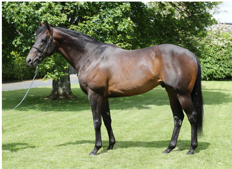
Invincible Army has several runners on Friday | Yeomanstown Stud

12,000gns Tattersalls October Yearling Sale (Book 3) 2022