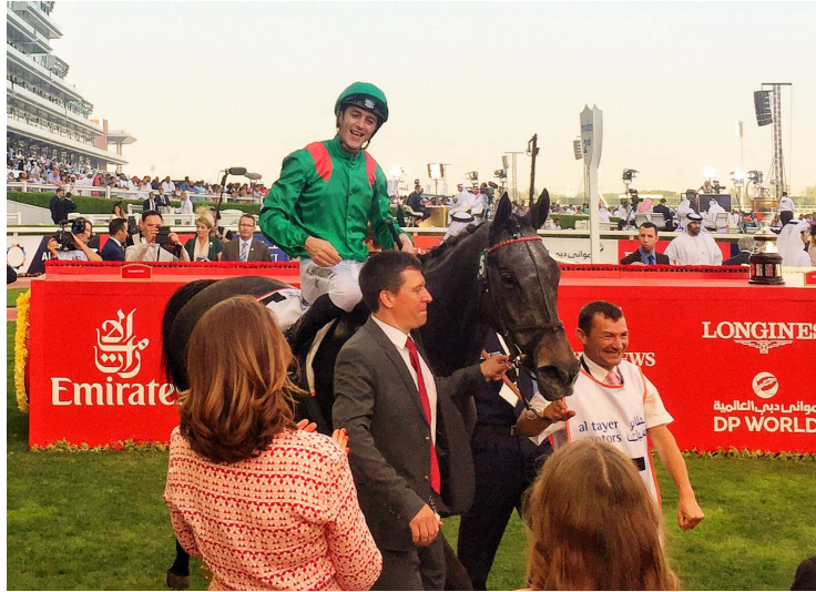
Christophe Soumillon aboard Vazirabad

saddle, Soumillon also has plans to work with retired racehorses and France's Au-Dela Des Pistes movement in retraining them for other disciplines. Cont. p7