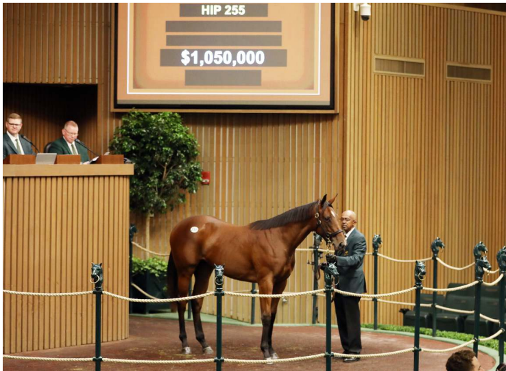
Just Jules sells as a yearling