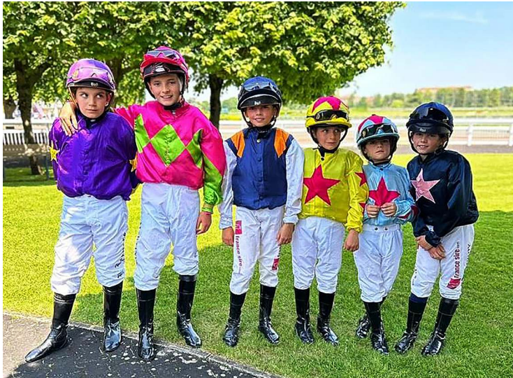
Young jockeys at the races