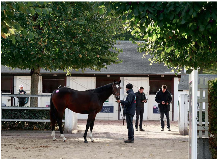
The sale continued in Deauville amid sunshine and showers