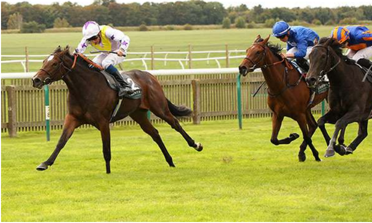
Lezoo | Tattersalls