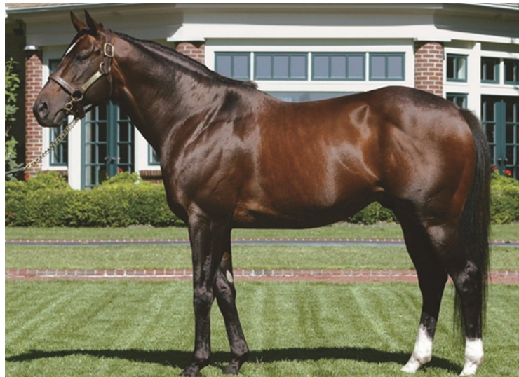
Langfuhr

Langfuhr, a son of Danzig and a top sprinter of the 1990s, has died at the age of 31 at Lane's End, the farm said in a press release early Thursday morning. A sire of 75 stakes winners, five champions and progeny earnings of over $119 million, Langfuhr was a member of the Lane's End Farm stallion roster from 2004 to 2018 when he was retired from stud duty at age 26.