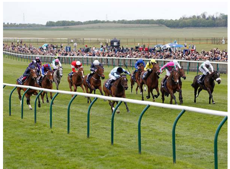
Cachet