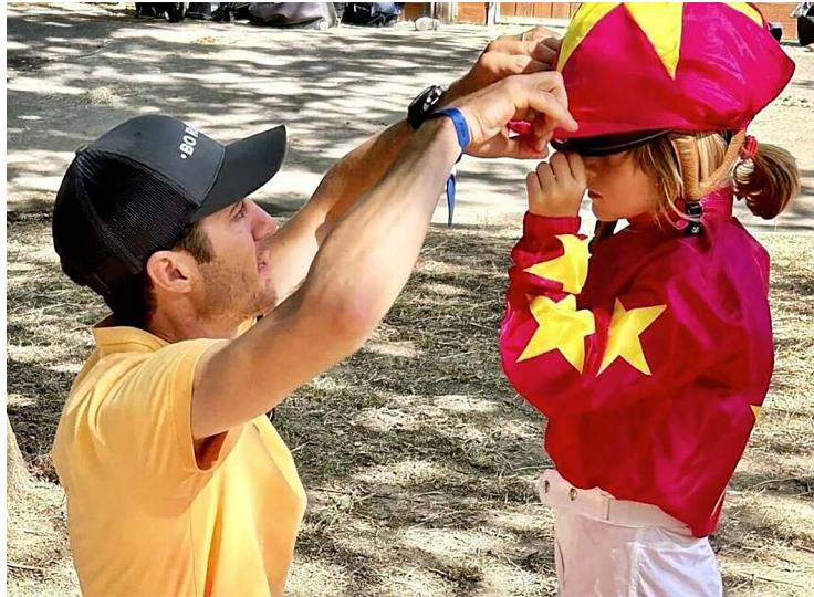
Christophe Soumillon with one of his pupils