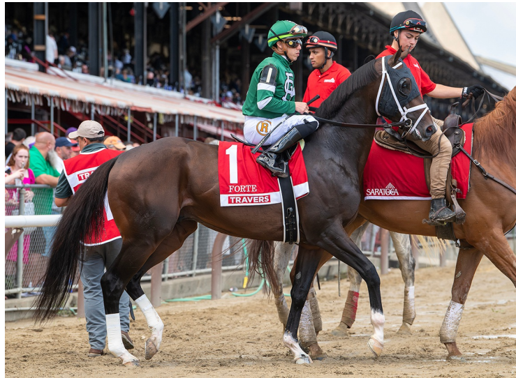
Forte just prior to the Travers this summer

the races he won. He won Grade Is both years and had two great seasons. It's hard to retire these horses, but sometimes you have to look at the big picture and make some really tough, emotional decisions."