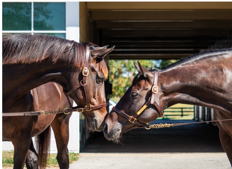
Centre Court and Morticia at Shawnee Farm