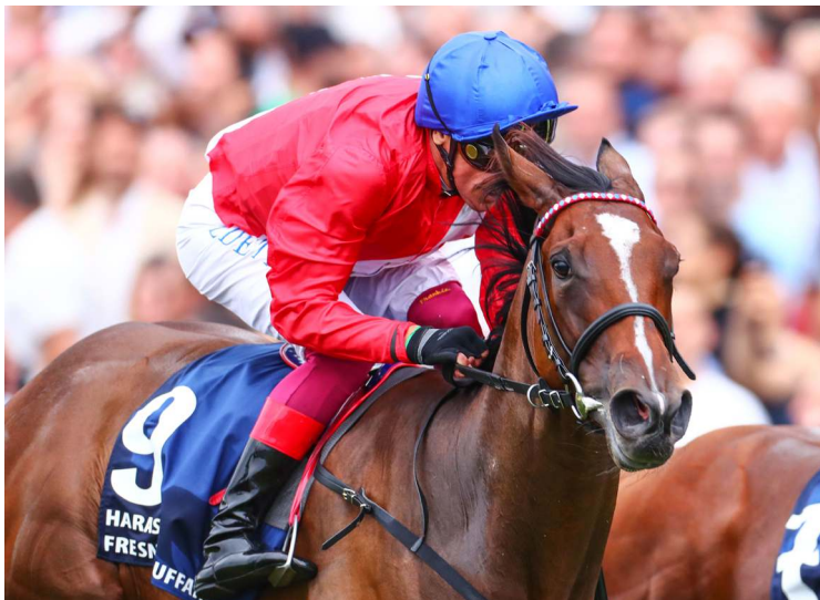
Inspiral