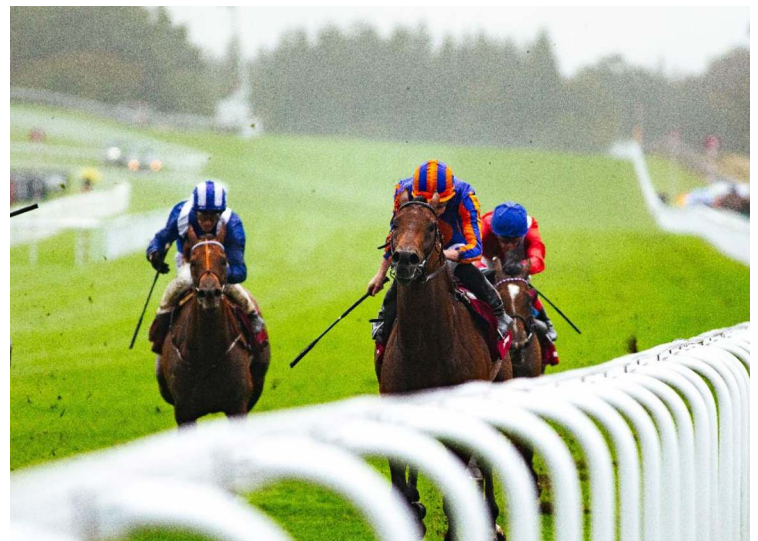
Paddington | Goodwood Racecourse