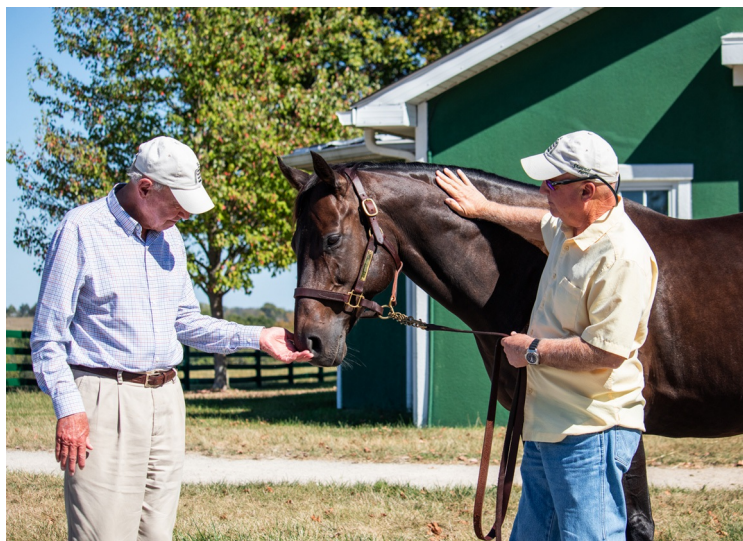
Arnold and Humphrey check in with Morticia