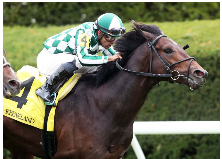
Lincoln Highway | Coady