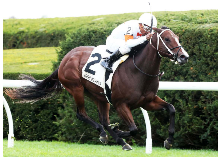
Makeup