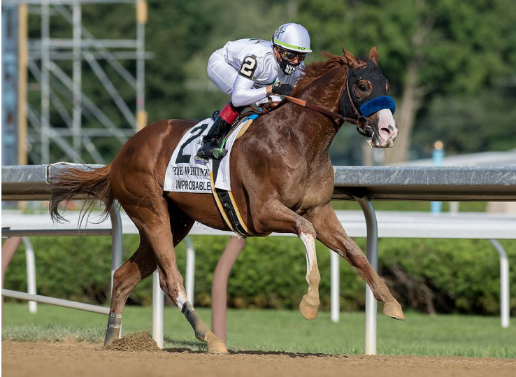
Improbable wins the Whitney

Undefeated at two, Improbable broke his maiden at first asking at 'The Great Race Place' in late September of 2018. He followed that up with a score in the Street Sense S. at Churchill Downs in early November, an effort which earned him a 'TDN Rising Star' badge. Improbable's juvenile year ended with a five-length victory in the GI Los Alamitos Futurity.