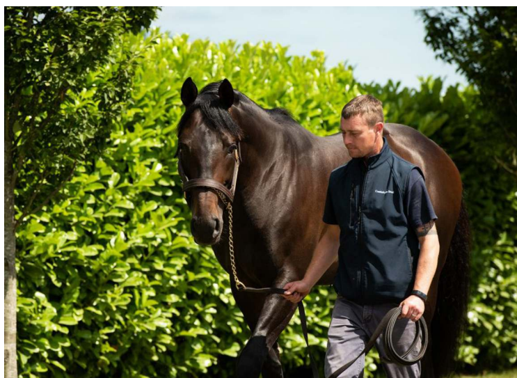
Arizona | Coolmore

€4,000 RNA Goffs Autumn Yearling Sale 2023