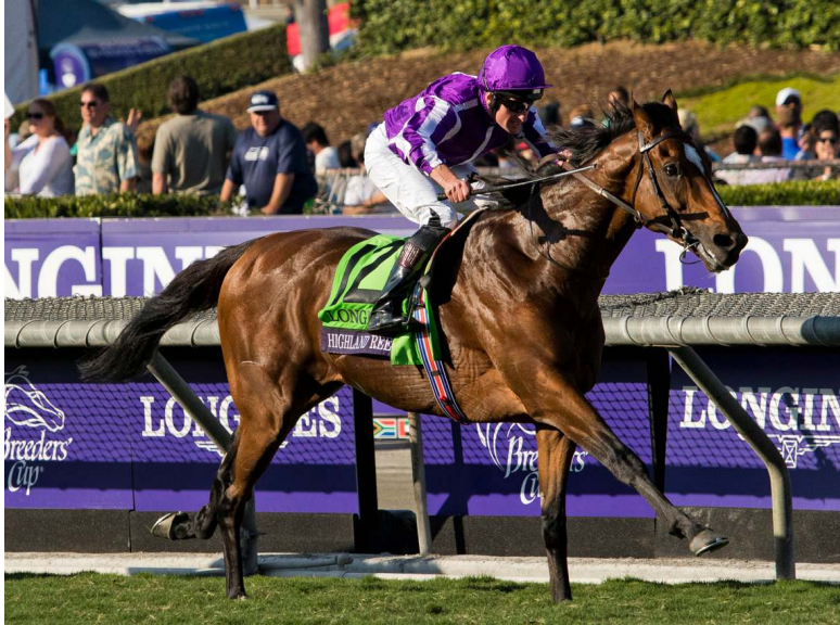
Highland Reel en route to victory in the GI Breeders' Cup Turf at Santa Anita Park