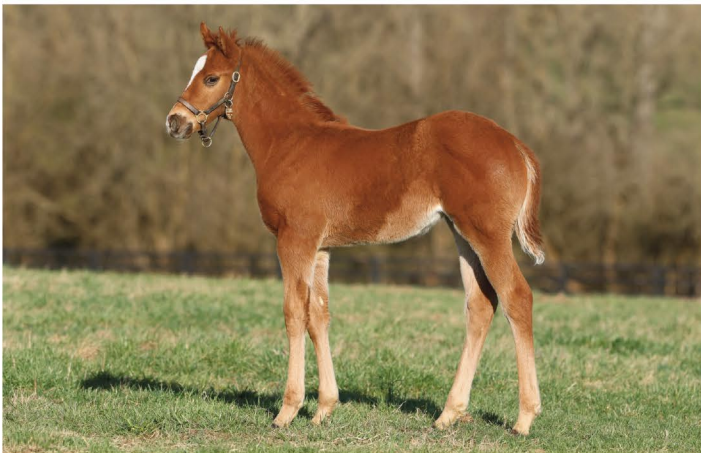
Filly out of Simply The Best , bred by Brookdale Farm, LLC