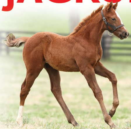
Colt out of Prima Ballerina , bred by Forty Oaks