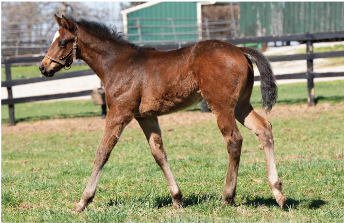
Colt out of Osheen , bred by Porta Pia Stables LLC