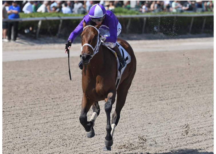
Launch

The fourth stakes winner for Omaha Beach, Launch is out of a half-sister to the dam of GISW and sire Silve State ( Hard Spun ). This is also the family of GI Kentucky Derby winner Monarchos (Maria's Mon). Spark has a 2-year-old Authentic filly and foaled a colt by Bolt d'Oro this year. Click for the Equibase.com chart or VIDEO, sponsored by FanDuel TV.