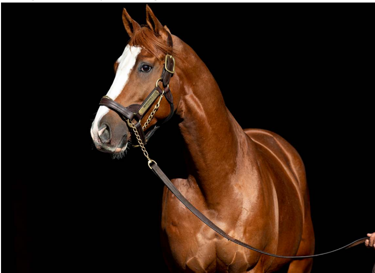
Improbable