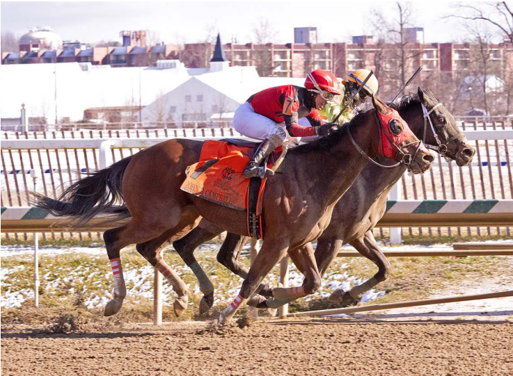
It's Sizzling Time (inside) outduels Double Crown in John B. Campbell Stakes