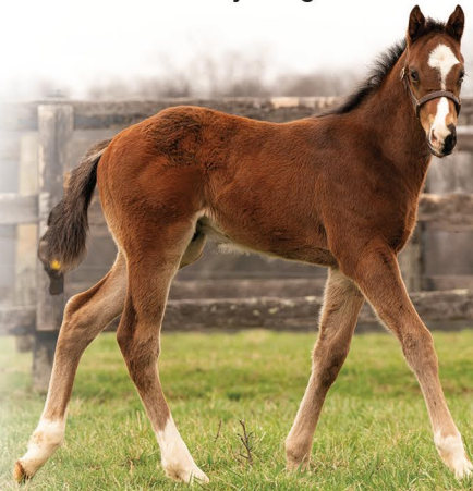
Colt out of As The Snow Flies , bred by Ryan Scherer