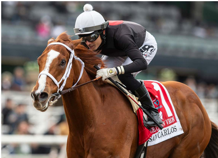
The Chosen Vron

It was quite a week for The Chosen Vron (Vronsky). First he was named the 2023 California-bred Horse of the Year and then he won for the 16th time in his career when he captured the GIII San Carlos S. Saturday at Santa Anita. He is now 16-for-21 lifetime. It was the fourth graded stakes win for the popular 6-year-old gelding