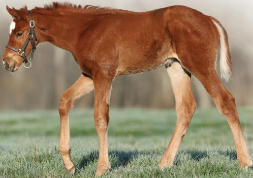
Colt out of Mooghareadh , bred by Springhouse Farm