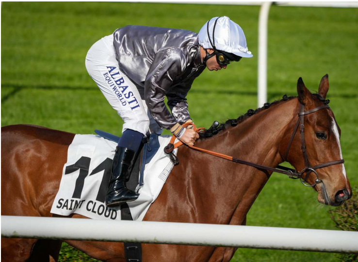
Cartimandua on debut at Saint-Cloud