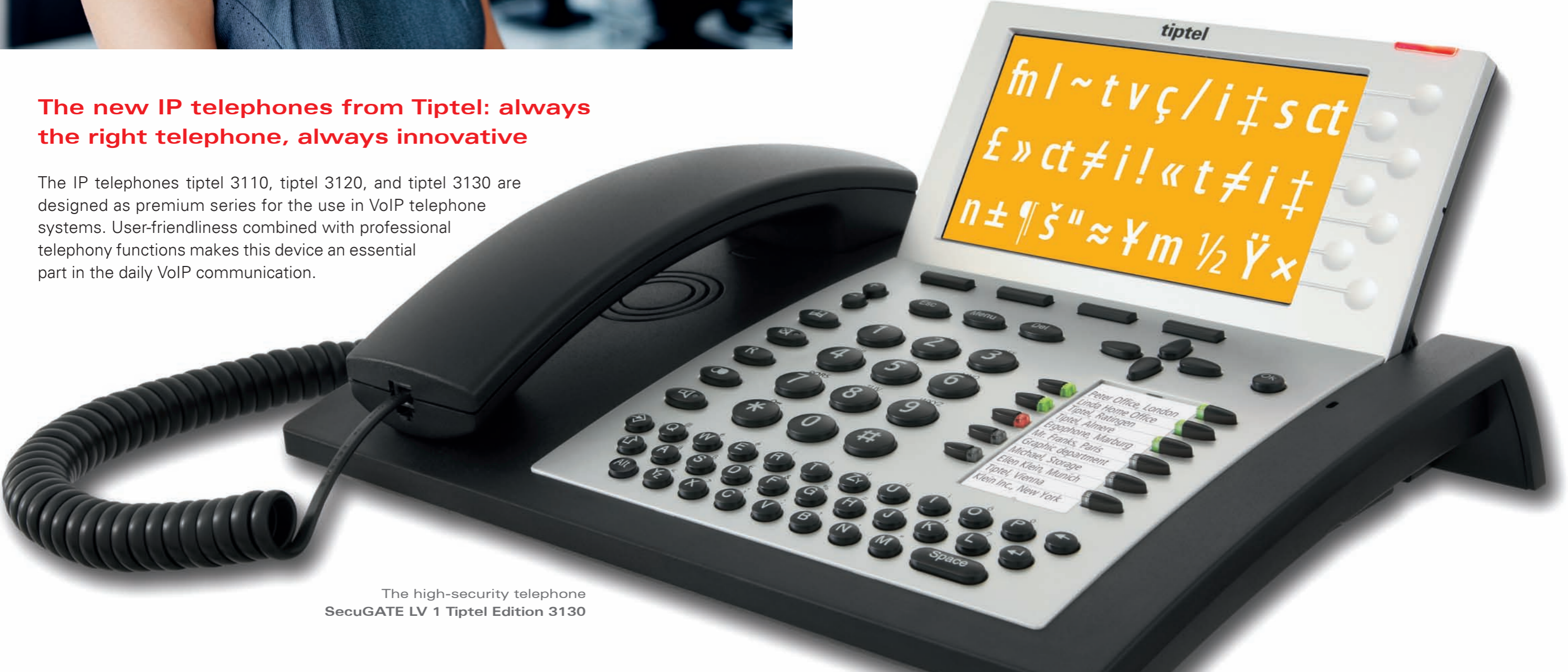
The high-security telephone SecuGATE LV 1 Tiptel Edition 3130

The IP telephones tiptel 3110, tiptel 3120, and tiptel 3130 are designed as premium series for the use in VoIP telephone systems. User-friendliness combined with professional telephony functions makes this device an essential part in the daily VoIP communication.