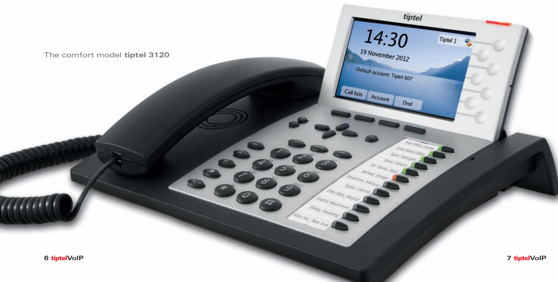
The comfort model tiptel 3120

Function keys can be configured individually like busy lamp indicator, one touch dial or call forwarding. As an example, the administrator is able to print out the individual labels for phones to be used as individual inlay for each phone.