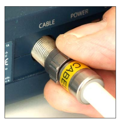
Self-Install ™ with finger friendly nut

Use the Self-Install™ for CATV, satellite receivers, cable modems and other settop box applications. The waterproof versions can be used for any outdoor application such as parabolic dishes etc.