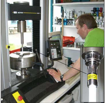
Computer controlled test of the pull strength

- is the perfect companion to go with a couple of Self-Install™ connectors for home installations. The pocket installer combines a RG6/59 cable stripper with mechanical stop for proper stripping length and an 11 mm spanner. The Pocket installer makes the cable preparation much easier and precise, while the spanner can be used for proper tightening.