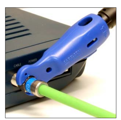
Proper tightening with the Pocket installer