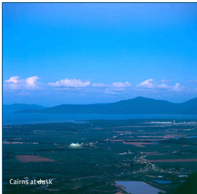
Cairns at dusk

Transport and Main Roads services the state-controlled road network in Queensland. The department's Queensland Transport and Roads Investment Program 2010-11 to 2013-14, outlines what the department is doing in the Far North Region of Queensland, now and in the future. The department's Cairns Office is the main point of contact for residents, industry and business to connect with Transport and Main Roads and learn more about what is happening in the area. State road projects in and around the Far North Region are funded by the Queensland Government and the Federal Government. In the current roads program, the Queensland Government is investing over $203 million in the region (including over $28 million in Transport Infrastructure Development Scheme projects), and the Federal Government is contributing around $209 million. Developers also contribute to the roads program.