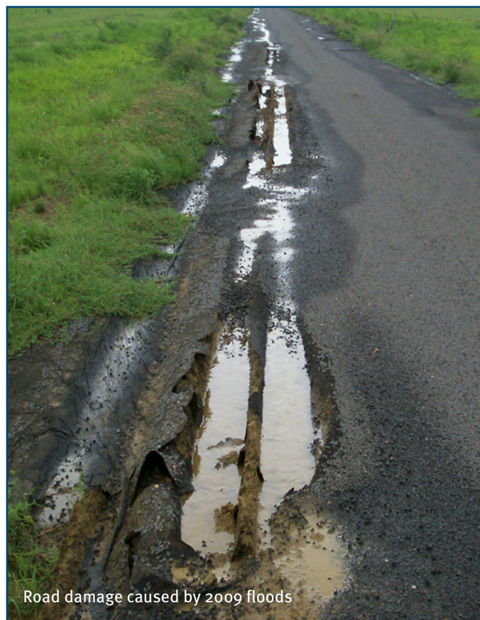
Road damage caused by 2009 floods