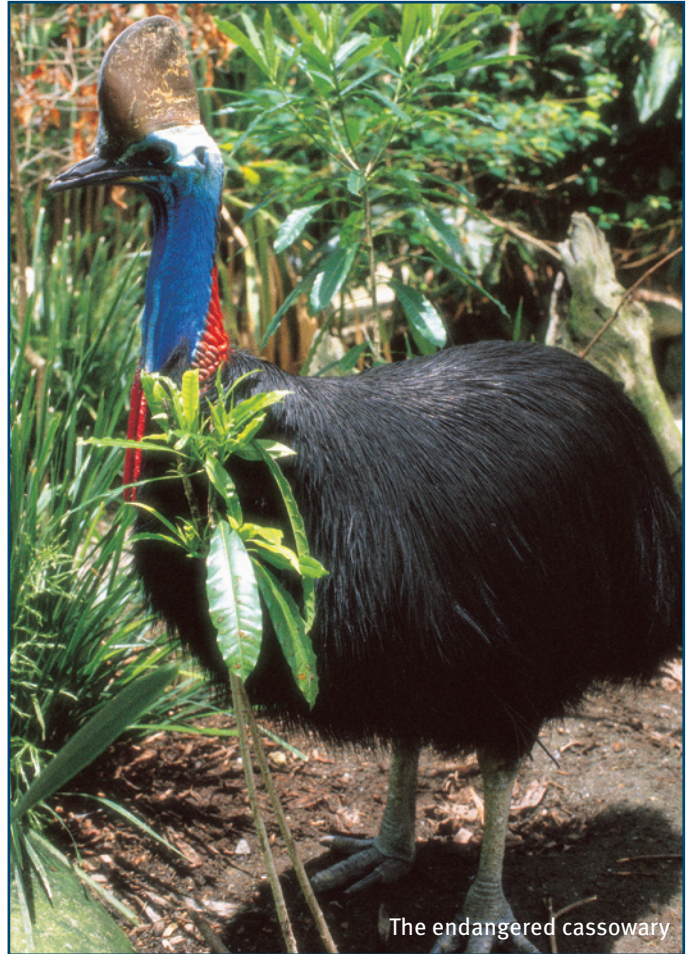
The endangered cassowary