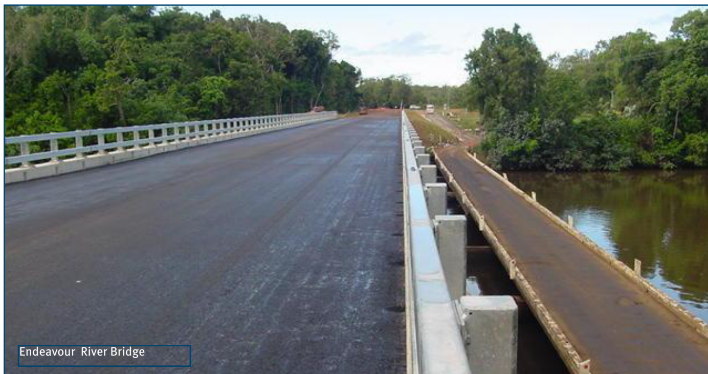
Endeavour River Bridge