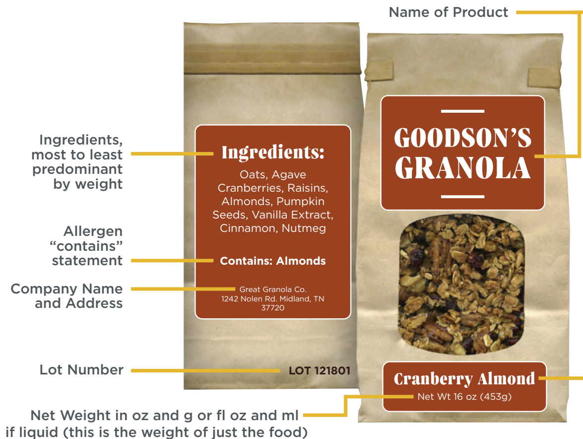
Figure 1. Required label components for manufactured foods.