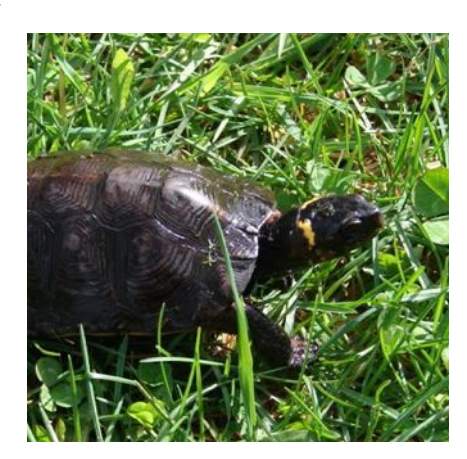
Top to bottom: Brook Trout; Bog Turtle showing characteristic yellow neck markings/next page: Sunlight on Hemlocks

This region contains all of the Brook Trout resources in the state and is home to several populations of Eastern the only Bog Turtles in the state.