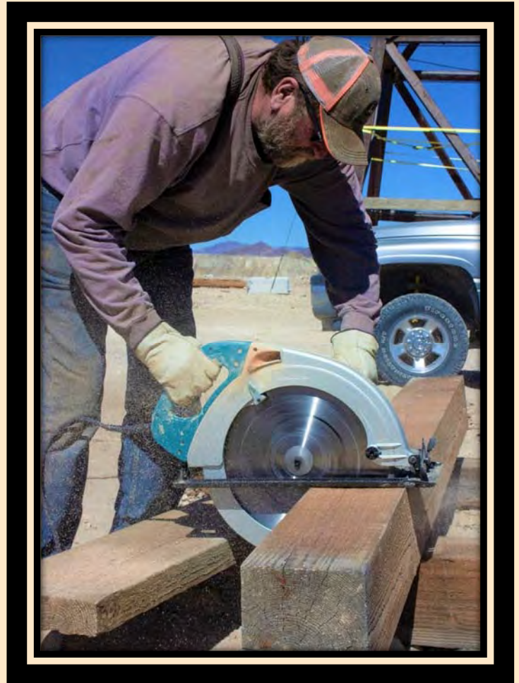
Stretch repairing the Silver Top mine collar.