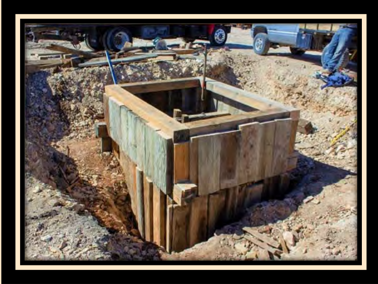
Silver Top mine collar after repairs.