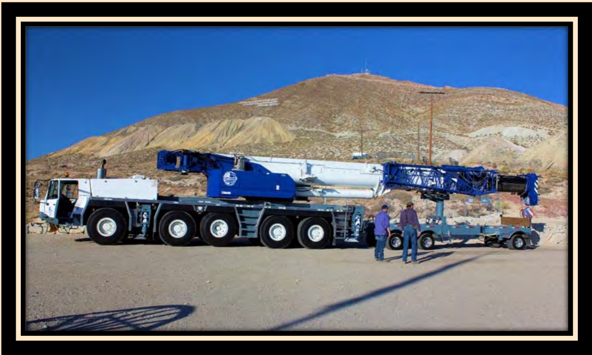
A large crane is brought in to lift and move the Silver Top.