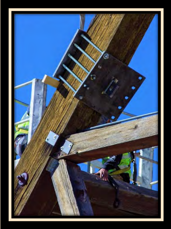
Metal support boxes were placed on the Silver Top Headframe for the crane to lift the structure.