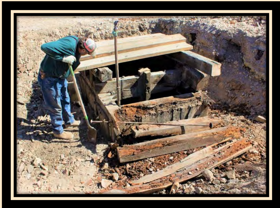
Inspecting damage to the Silver Top mine collar.