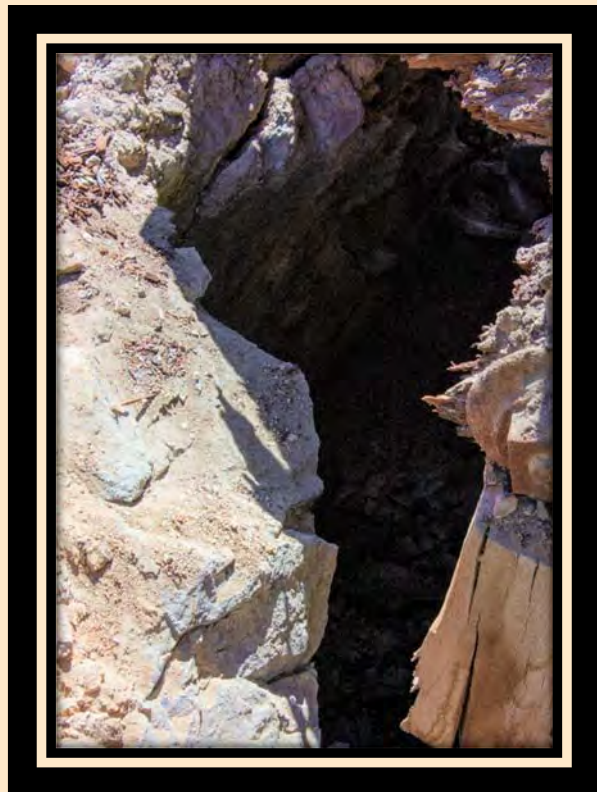
A hole that opened up outside of the Silver Top mine collar.