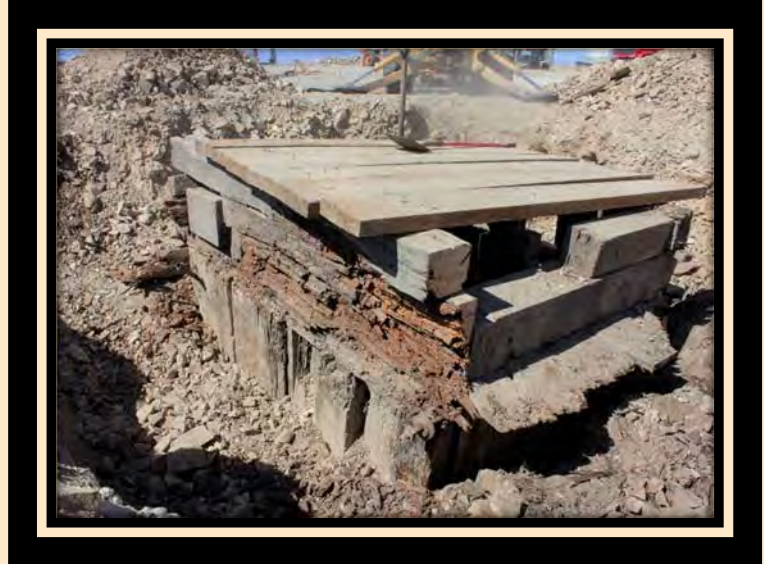
Damage to the wooden Silver Top mine collar.