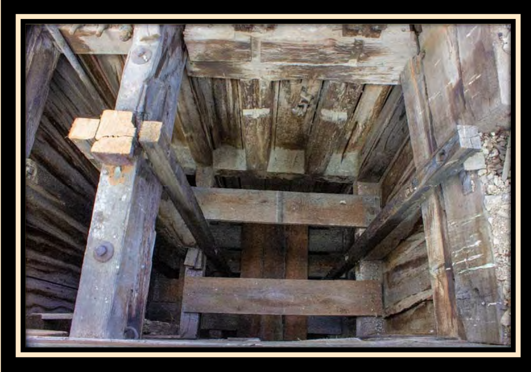
A look down the Silver Top mine shaft after new landings have been placed.