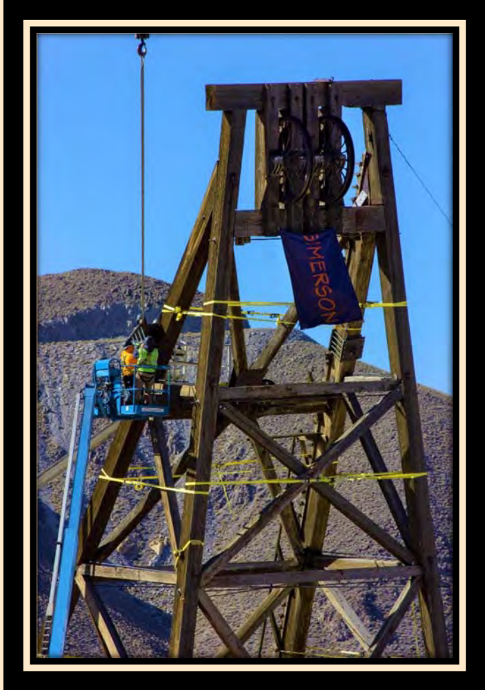
Simerson crew places tie-down straps on the Silver Top Headframe to keep the structure together when moving it.