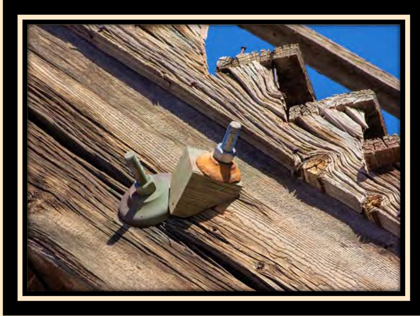
New bolts are placed in the Silver Top Headframe to help reinforce the structure.