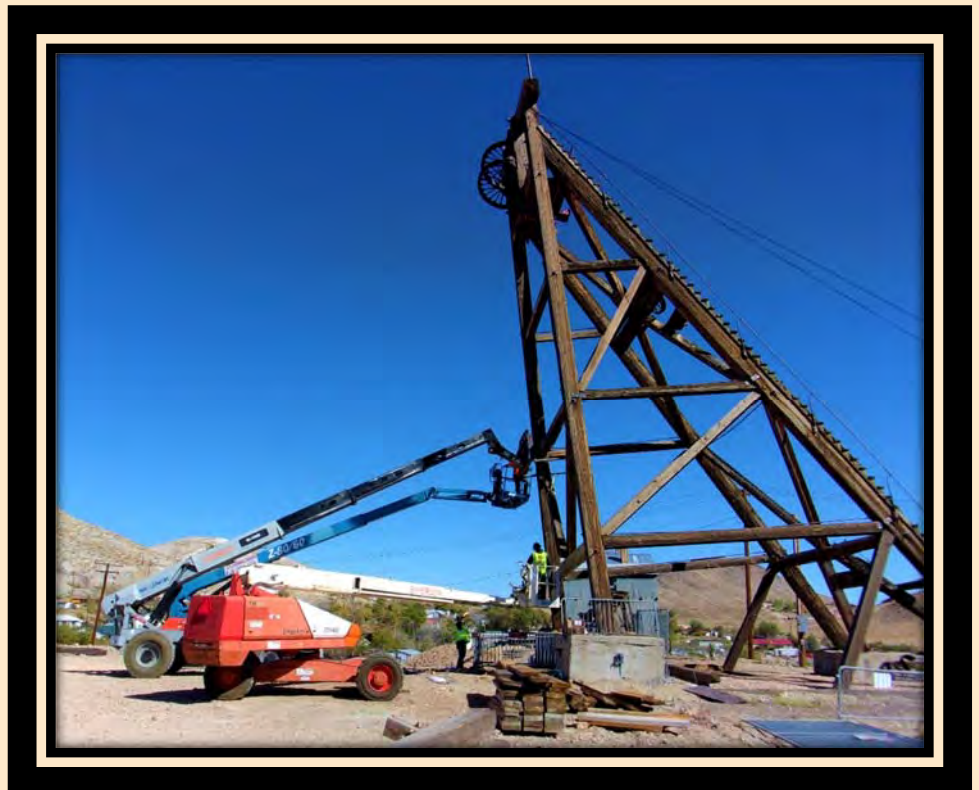
Placing the new bolts into the Silver Top Headframe to reinforce the structure.