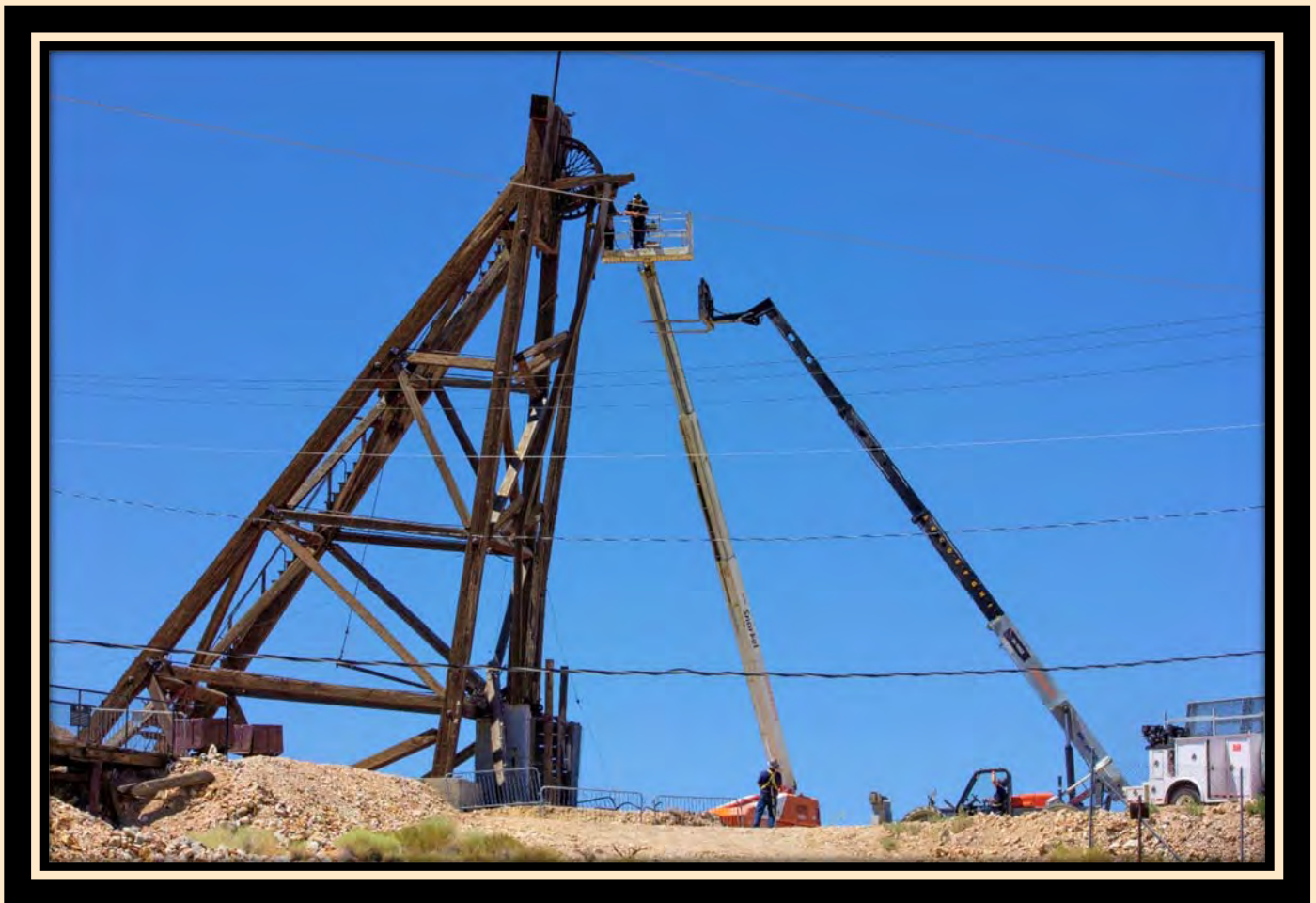
Small cranes are brought in to remove the elevator from the Silver Top Headframe.

While the Silver Top Headframe Restoration project is almost complete, the Tonopah Historic Mining Park Foundation is still actively seeking much needed funds to pay for the restoration of the Silver Top Orehouse and Desert Queen Headframe. Please take a moment, renew your membership, and send us a donation! A portion of this project has been funded with the assistance of the Commission for Cultural Centers and Historic Preservation, which provided just over $100,000. Round Mountain Gold (Kinross) has saved us at the last minute through a grant of $40,000. Crews from Simerson first removed the mine cage elevator from the Silver Top Headframe. They then tightened all bolts and placed new ones. Next, the crew used tie down straps to ratchet the wood members together. The legs of the Headframe were then chain sawed from the blocks of cement placed there in the 1990s, and a large crane moved the Silver Top Headframe away from the shaft. Work was then done on the shaft, including placing new landings, repairing the collar and using expanding foam around the collar. A new concrete foundation was poured and the Silver Top Headframe will be placed back where it belongs, on top of the new foundation.