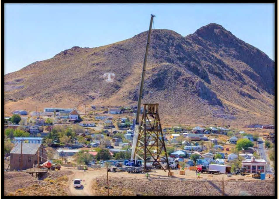
The large crane swings the Silver Top Headframe over to its temporary position.