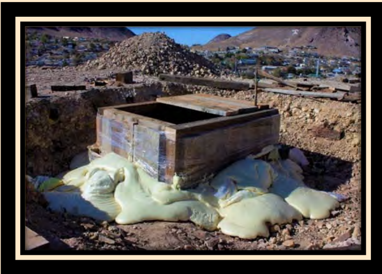
Expandable foam was placed around the Silver Top mine collar to prevent it from reopening on the sides, and then covered back up with dirt and rocks.