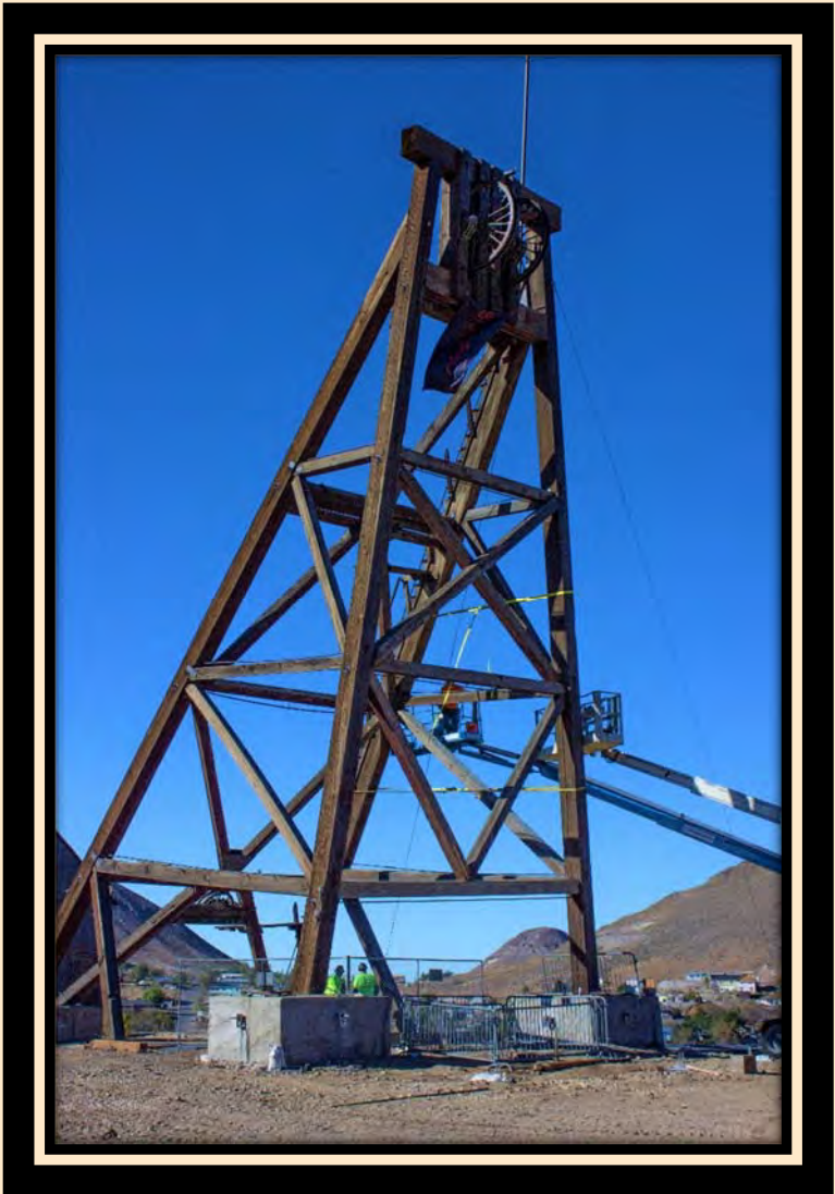
Tie down straps are placed on the Silver Top Headframe to keep the wood from pulling apart when lifted.