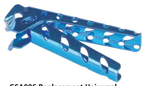
GSA006 Replacement Universal Pot Lifter Quality coloured anodised aluminium pot lifter