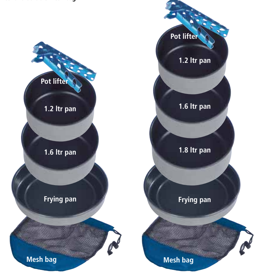
GST101 Cookset 2 CookSet2 (584g) consists of 1.6/1.2 litre pans with 0.8 litre frying pan, pot lifter and durable mesh bag.

Lightweight hard anodised aluminium pan sets with non-stick Teflon coating and internal volume guides. Grooved bases improve stability when in use as they minimise slippage on the serated pan supports and reduce "spin" when stirring. Cooksets are stackable and packable with the frying pan able to double as a heat saving lid or as a food warmer on top of the 1.2 litre pan. All sets come complete with a frying pan, pot lifter and durable mesh bag.