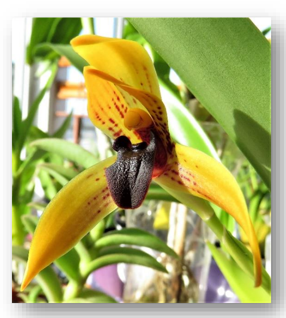
Maxillaria cucullata. The species epithet means hooded referring to the petals and dorsal sepal covering the column. It has been blooming for the past 6 months.