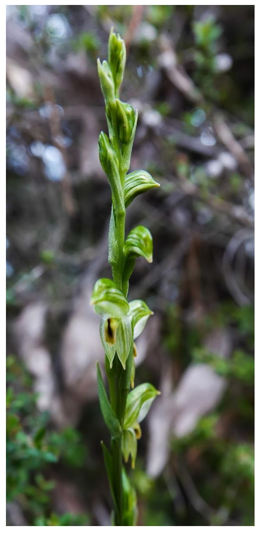
Pterostylis melagramma (blackstripe greenhood)

Ausgro Bark will be available in a week or so. Cost for a 50-litre bag will be $30 and comes in small, medium and large sized bark. If you require some bags you will need to advise Alan Millward on Ph. 62722031 or Mob. 0422 356 269 to reserve your bags ASAP as ordering will be on a first in first served basis. Orders will need to be picked up from Alan promptly after they arrive.