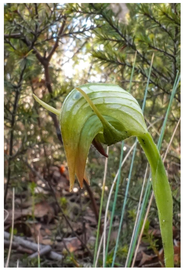
Pterostylis nutans (Nodding Greenhood)