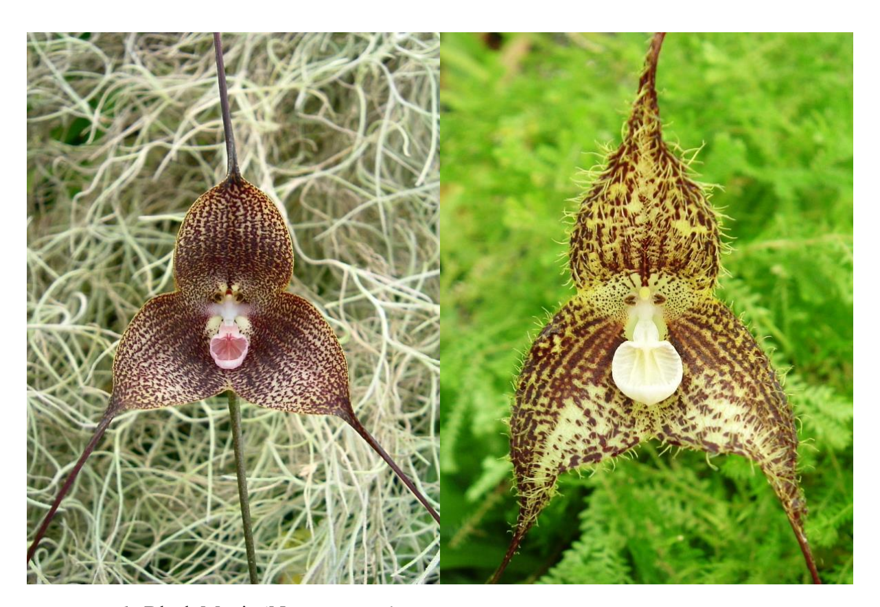
Dracula Black Magic 'Necromancer'