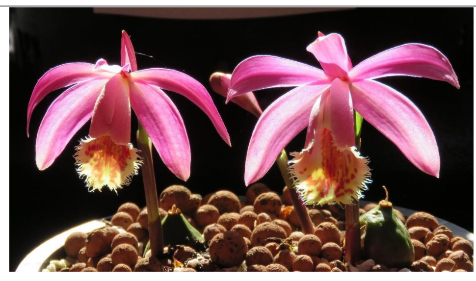
Some Pleione goodness grown by Barry Davidson.

General Meeting Monday 14<sup>th</sup> December 2020 Please bring supper