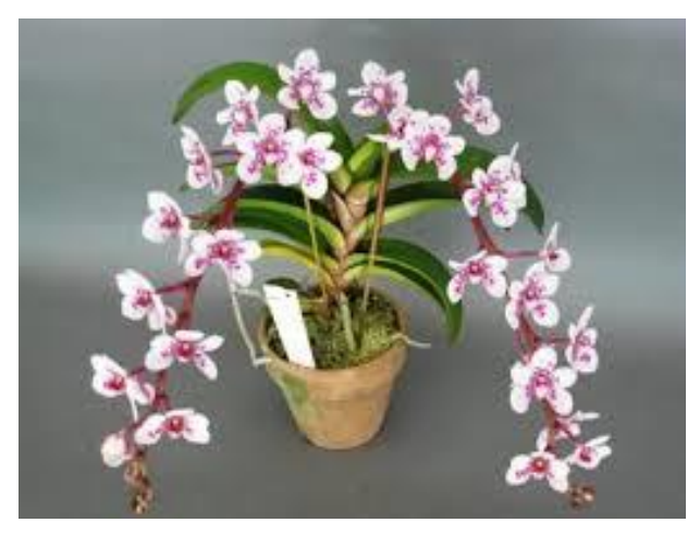
Right . In 2000 Srts. Braveheart was registered. The crossing is Sarc. Fitzhart x Rhy. gigantea.

There are photos of each crossing and if you are lucky enough to still have your Srts. Braveheart 'Sandy' you will see what you may get remembering that it is a seedling. I can't wait for mine to flower.