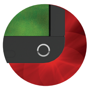
Modern Curved Corner Design in High-Gloss Black and Sleek Stand

The Toshiba 32" L1400U is the ideal slim LED TV for your living room or as an extra TV in the bedroom. With a modern design, curved corners and elegant stand, the 32" L1400U is energy efficient, featuring an LED-backlit display. When it comes to image quality, it delivers vibrancy and rich contrast—everything you want from a TV. Equipped with Dynamic Picture Mode, it delivers maximum contrast, clarity and color saturation. Plus, it features DTS TruSurround™ for immersive sound and clear dialog. Beautifully designed and perfectly sized, the 32" L1400U LED HDTV complements any décor whether on its elegant stand or mounted on the wall in your home.