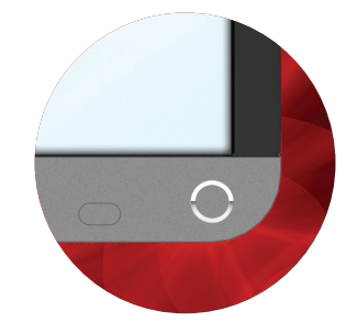
All-new, modern curved corner design with an elegant gun metal finish and sleek stand

Cinema Mode with 3:2 pull down for film-like images from movies in 24fps