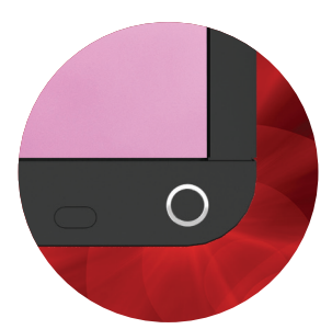
All-new, modern curved corner design in high gloss black with metal neck.

Cinema Mode for film-like quality movies