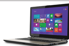
Satellite ® L55 Series Laptops