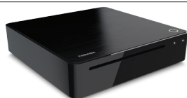
Symbio ® BDX5500 Streaming Media and Universal Disc Player