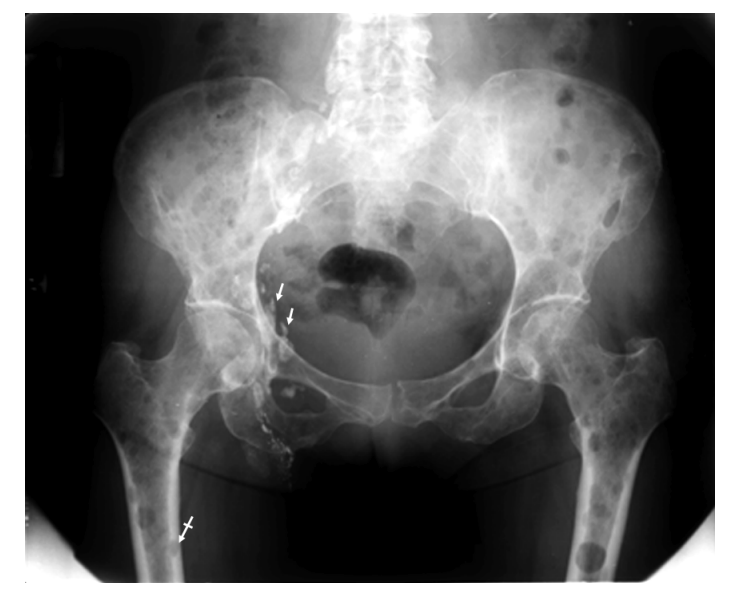
Figure 3 This AP pelvic radiograph displays multiple lytic areas and Ethiodol contrast material from a lymphangiogram in the right inguinal lymph nodes (arrows). Observe the endosteal scalloping of lucent areas within the femurs (bar arrow).