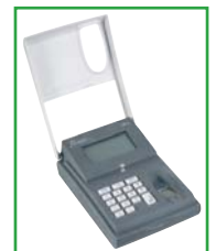
fi-5000N network adapter