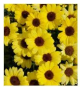
Arygranthemum Yellow Argyranthemum frutescens

Sun 12-24" tall. Has more profuse flowering and a larger bloom. Rich pink color, great in the spring.