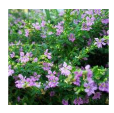
Cuphea Mexican Heather Cuphea hyssopifolia

Sun 36"x12". Easy and fun to grow! Late season interest of fluffy cotton balls.