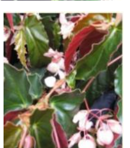
Angel Wing Torch Pink Begonia tuberosa

Shade 18" x 24". Large angel wing shaped leaves covered in silver spots