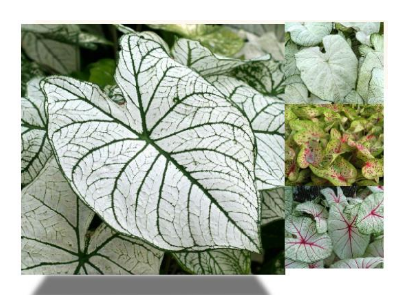
ASSORTMENT INCLUDES: CANDIDUM, JUNE BRIDE, MISS MUFFET, WHITE QUEEN, AND WHITE CHRISTMAS