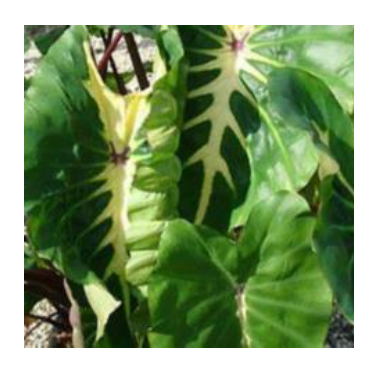
Colocasia Royal Hawaiian Maui Sunrise

All Calibrachoa combo for baskets! Includes Aloha Kona Dark Red, Aloha Kona Pineapple, and Aloha Kona True Blue