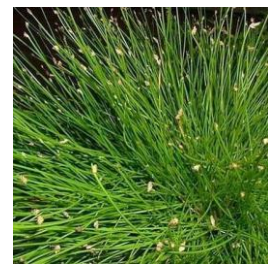
Grass Fiber Optic

Sun 12" x 24". Adds great texture to landscapes