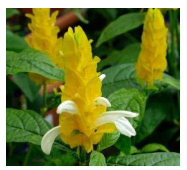
Golden Candles Plant Pachystachys lutea

Part sun to shade 20" x 18". Bright green foliage that contrasts great in containers.