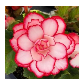
Amerihybrid White/Red Piccottee Begonia tuberosa Shade 12"x12"