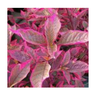
Iresine Blazin' Rose

Bright shade 24" x 36-48". Unique flowers and all around nice plant for shade combinations.