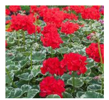
Geranium Wilhelm Langguth Pelargonium hortorum

Produce silvery green leaves that are bordered in creamy white and topped with large clusters of double scarlet-red flowers.