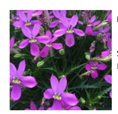
Isotoma Pop N Fizz Violet

Sun 3' x 3-4'. Rich red flower buds at branch tips, followed by small black fruit.