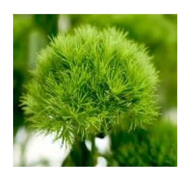
Dianthus Green Ball

Sun 18-24" tall. Blooms all summer long with yellow to orange flowers. Hummingbirds love it!