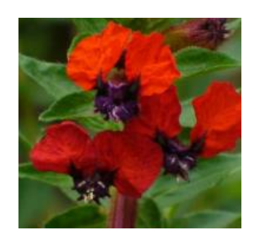
Cuphea Bat Face

Sun 36"x12". Easy and fun to grow! Late season interest of fluffy cotton balls.