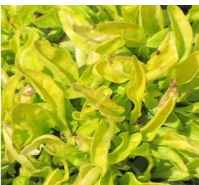
Alternanthera True Yellow Alternanthera dentata Shade 14" x 12

Partial sun 12" x 12". Green and pink foliage interest. Great low maintenance plant.