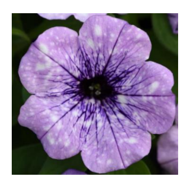
NEW! Petunia Headliner Crystal Sky

8" x 24". Non culinary oregano. Used in dry flower arrangements.