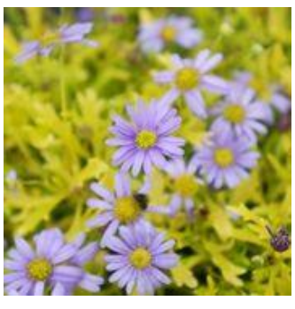
Brachyscome Neon Lights