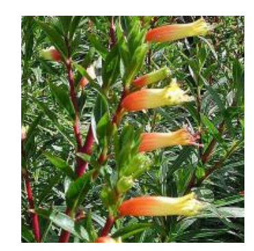
Cuphea Candy Corn

Sun 3' x 1'. Upright plant that produces candycorn shaped flowers.