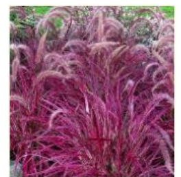
Pennisetum Fireworks Grass

Sun 18" x 24". The best of both worlds! Curled and straight stems.