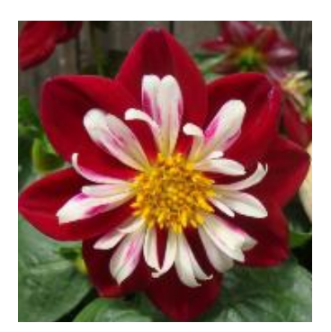
Dahlia Starsister Red/White

Sun to part shade 24" x 12". Interesting ball shape flower is great in containers and can be used for cut flowers.