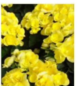
Begonia hiemalis Shade 12" x 9". Abundant bright yellow blooms, perfect for shade containers and beds.