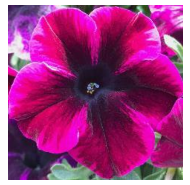
Crazytunia Cosmic Purple

Sun 12" x 12-15". Red flower with a black center that most certainly resembles a bat's face.