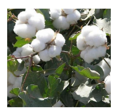
Green Leaf Cotton Gossypium hirsutum

Sun 36"x12". Easy and fun to grow! Late season interest of fluffy cotton balls.