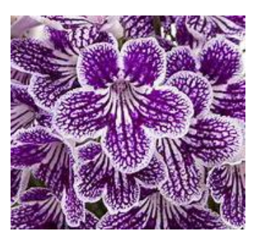
Streptocarpus Grape Ice

Sun 24" x 36". Hot pink flowers that bloom from May to October.