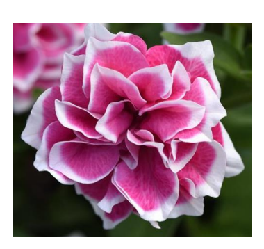
Petunia Pink Diamond