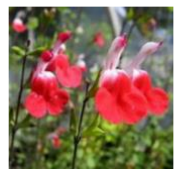
Salvia Hot Lips

Part sun or shade 10" x 18". Green spike flower accented by bright petals.