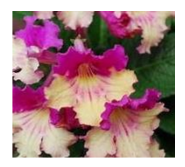
Streptocarpus Pink Cap

Shade to part shade 12" x 15". An attractive foliage plant that has a tropical appearance.