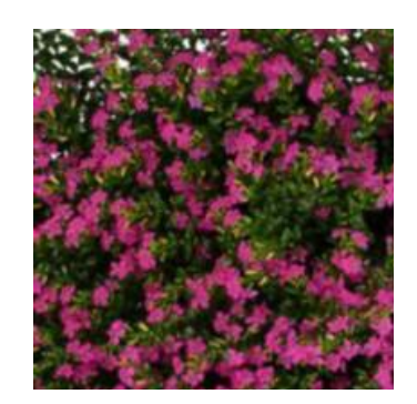
Cuphea FloriGlory Diana Cuphea hyssopfolia

The unique combination of rosy-pink and yellow gives way to orange tones under cooler conditions.