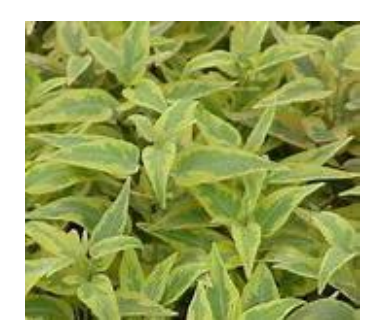
Solanum Variegated Potato Vine

Sun 16" x 24". As the name implies this flower resembles bright red lips. Likes it hot and dry.