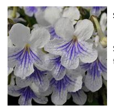
Streptocarpus White Ice

Shade 12" x 12". White flower, blue cente