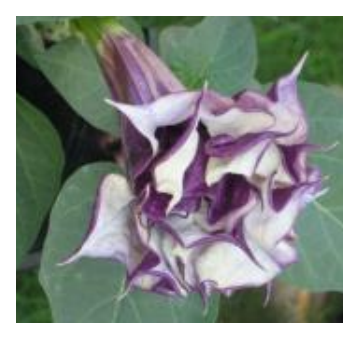
Datura Ballerina Double Purple

Sun or shade 3' x 15". Silver foliage that creeps and spills over containers