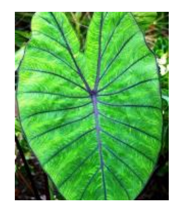
Colocasia Blue Hawaii