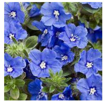
Evolvulus Blue My Mind