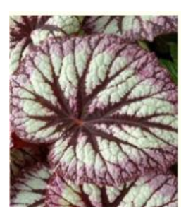
Rex Non Patented

Shade to sun 6" x 18". Trailing Begonia with attractive dark colored leaves. Small white flowers will appear, but are not showy.