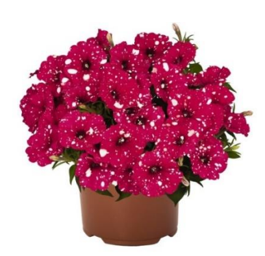
Petunia Surprise Sparkle Red