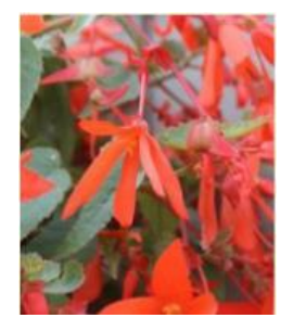
Bossa Nova Orange Begonia boliviensis