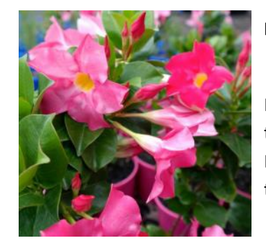
Dipladenia Madinia Pink

Sun 3'x 2'. Light and dark purple mix together to produce a show stopping flower.