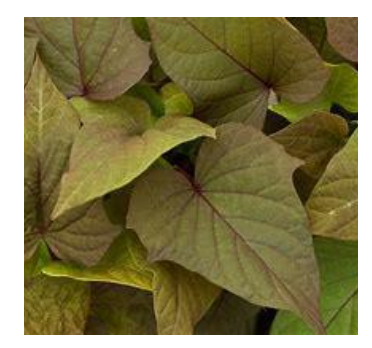
Sweet Georgia Bronze

12 x 30". Attractive heart shaped leaves start chartreuse and turn deep purple in color with distinctive red veins