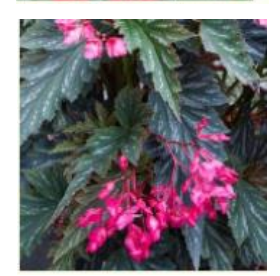
Begonia coccinea Shade or filtered light. 24" x 18" Grown for silvery green angel win