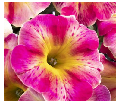
NEW! Crazytunia Peach Bellini

Sun 3' x 1'. Upright plant that produces candycorn shaped flowers.