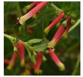
Cuphea Honey Bells Cuphea hybrida

10-12" x 14-20". This boasts eye popping bicolor rose and light yellow tubular shaped flowers. Semi trailing habit.