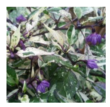
Ornamental Pepper Calico

Sun 24" x 18". Unique variegated lantana.