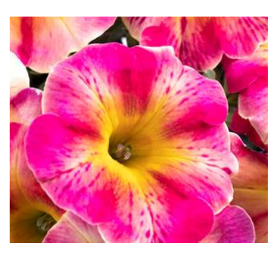
Crazytunia Peach Bellini