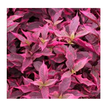
Alternanthera Brazilian Red Hots Alternanthera dentata

Partial sun 14-18" x 15". A bright and unique flower that was a "Made for Shade" selection. Compact and great for color in shade containers.