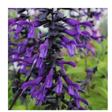
Salvia Amistad Salvia guarantica Sun 18" x 24". A hummingbird delight!