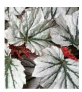
Angel Wing Looking Glass Begonia coccinea

Light shade 18-24" tall. A smooth textured plant with silver gray foliage, with dark pink under the leaves.