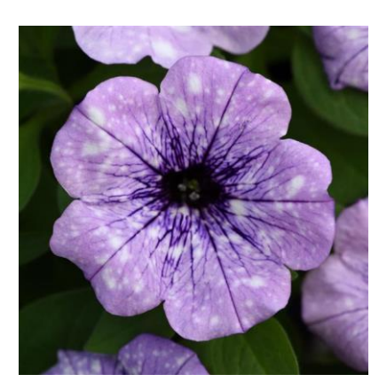
Petunia Headliner Crystal Sky