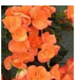
orange. Great color for shade.