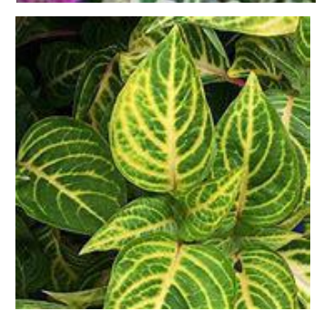
Iresine Blazin' Lime

Part sun to shade 20" x 18". Bright green foliage that contrasts great in containers.