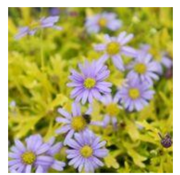
NEW! Brachyscome Neon Lights

Sun 6-10' tall. Broad variegated foliage contrasts nicely with the nodding peach blooms. Fragrant at night!