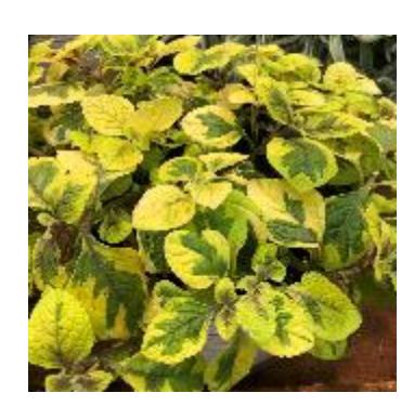
Plectranthus Fancifillers Guacamole