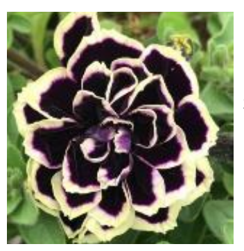
Petunia Midnight Gold

Sun. Black foliage, eventually produces clusters of black pearl-like shiny peppers.