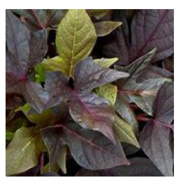
Sweet Georgia Purple Ipomeoea batatas

Deep purple lobed leaves, great for trailing from baskets and containers.