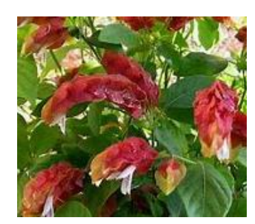
Shrimp Plant Fruit Cocktail

Sun 15" x 20". A very popular plant that does well in hot conditions.