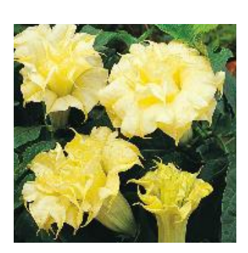
Datura Ballerina Double Yellow

Full sun 24" x 15". Bright trumpet shaped blooms. Excellent for growing on a trellis.