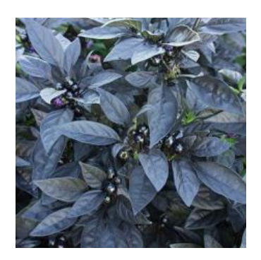
Ornamental Pepper Black Pearl

Full sun 6" x 12". White star burst over a dark blue. Heat tolerant.