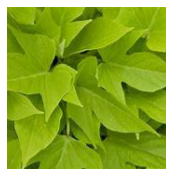
Sweet Georgia Light Green

12" x 30". Lobed leaves remain light green in color, with a trailing habit. Coarse texture helps it to stand apart.