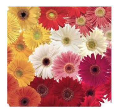
Gerbera Festival Series

Sun to part sun 12" x 18". Delicate foliage and lavender flower spikes.