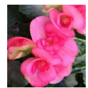
Shade 12" x 9". A darker shade of pink with multiple blooms