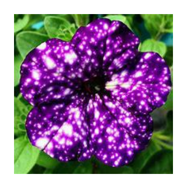
Petunia Night Sky

Full sun 10" x 24". Unique flower with white spots that vary with sun exposure.