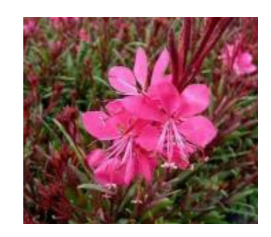
Gaura Belleza Dark Pink

Full sun 36" x 15". Fragrant gray green foliage.