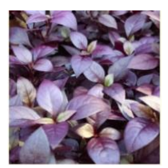
Alternanthera Little Ruby Alternanthera dentata

Full sun – part shade 10-12" x 18-20". Stunning bright pink foliage that is slightly variegated. Loves humidity and can be heat tolerant.