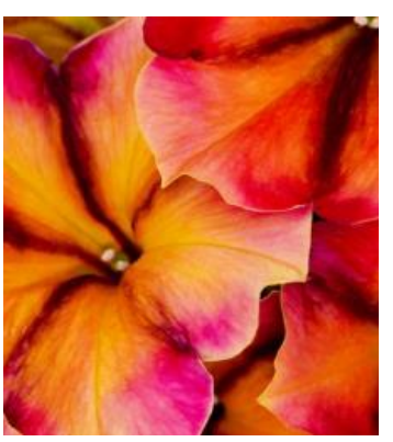
Crazytunia Tiki Torch

8"x12" Sun. Five times the flower power and vigor of standard Mexican heather.