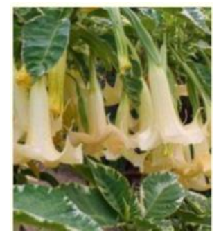
Varigated Brugmansia Peach Parfait

Sun 18-24" tall. Bright yellow that screams spring and pops in any container or landscape.