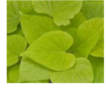
Sweet Heart Light Green

10" x 48". Heart shaped leaves in shades of bronze, rose, and brown. Sun or shade.