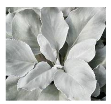
Full Sun 18" x 18". Can be used outside or as an indoor plant. Silvery and silky appearance