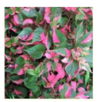
Alternanthera Party Time Alternanthera dentata

Full sun – part shade 8-10" x 18-20". Deep burgundy foliage is enhanced by lighter colored new leaves, spreading plant.