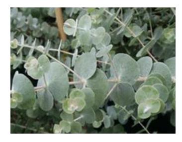
Eucalyptus Silver Blue

Shade or part sun 12x10". Has long, thin brick red flowers.