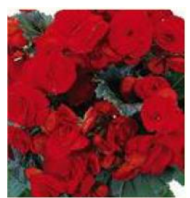
Begonia hiemalis Shade 12" x 9". A pleasant double red begonia bloom.