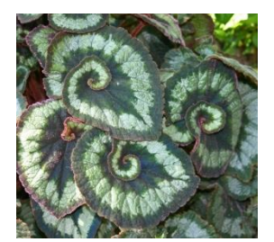
Escargot Begonia rex-cultorum

Sun to part shade 12-16" x 16-20". A well branched plant that looks awesome in containers or landscape.