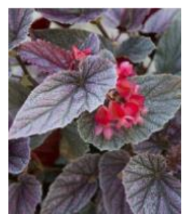
Angel Wing Miss Mummy Begonia coccinea

Light shade 18-24" tall. A smooth textured plant with silver gray foliage, with dark pink under the leaves.