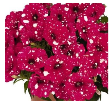
NEW! Petunia Surprise Sparkle Red

Shade – part shade 12" x 36". A stand alone.