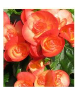
Begonia hiemalis Shade 12" x 9". A mix of peach colored blooms edged in darker