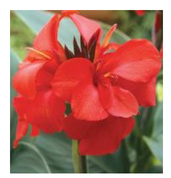
Canna Cannova Red Shades

Sun to shade 3" x 12". Distinctive flower display provides an interesting touch to containers.