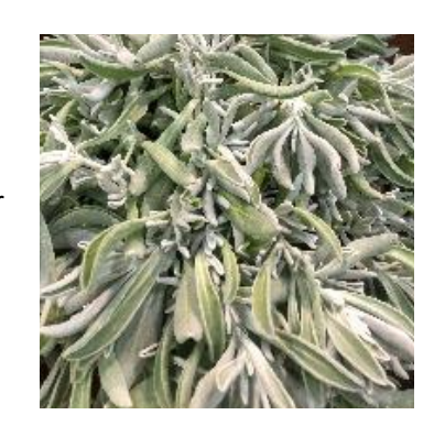
Didelta Fancifiller Silver Strand

Sun 12" x 12". Double flower with red being the bottom accent and white on top.