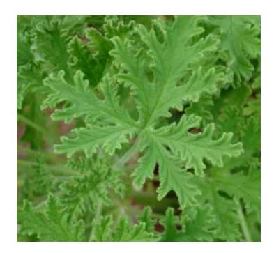
Citronella Mosquito Plant *SEE DISCLAIMER – PAGE 17*

Full sun 2'x3'. This plant is gaining popularity as a contianer item. The bright copper leaves compliment the surrounding flowers.