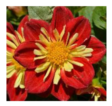
Dahlia Starsister Scarlet & Yellow

Sun 12" x 12". Deep scarlet petals highlighted by bright yellow petals.