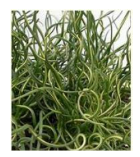
Grass Juncus Big Twister