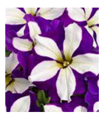
Petunia Lucky Lilac

Sun to part sun 12" x 18". A fun an interesting plant! Always a customer favorite.