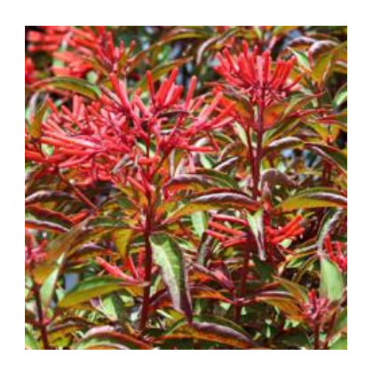
NEW! Hamelia Red

Part sun to shade 20" x 18". Colorful rose foliage accented by burgundy variegation.