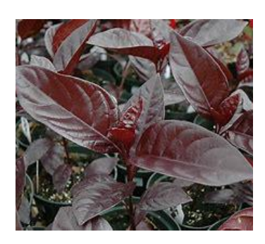
Pseuderanthemum Rubrum Shooting Star

Full sun 10" x 24". Unique flower with white spots that vary with sun exposure.