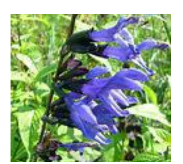
Salvia Black and Blue

Sun 15" x 20". A very popular plant that does well in hot conditions.