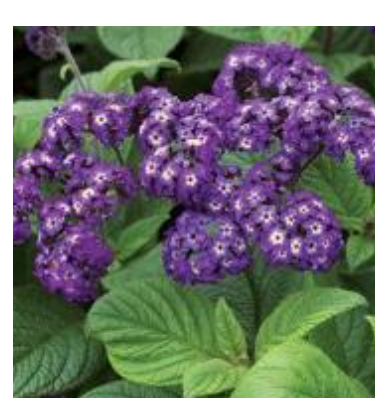
Heliotrope Fragrant Delight Heliotrope aborescens

Sun to part sun 12" x 12". Bright violet flowers.