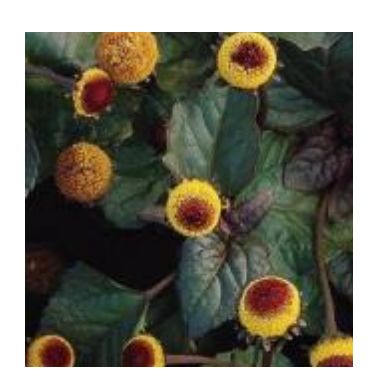
Peek A Boo Spilanthes

10-16" x 20-30". Features florescent colors, medium vigor and a mounding habit.