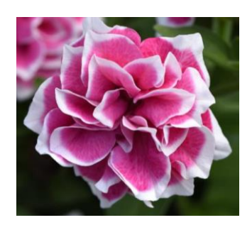
NEW! Petunia Pink Diamond

Sun to part sun 18" x 36". Showy tropical flowers on a strong vine. Trellis climber!