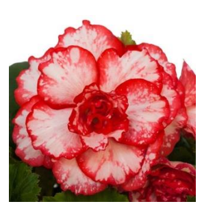
Amerihybrid Flamenco Picottee Begonia tuberosa Shade 12"x12"