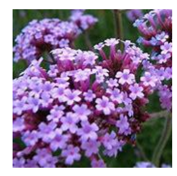
Verbena Bonariensis 'Cloud Nine'

Shade 12" x 12". White flower, blue cente