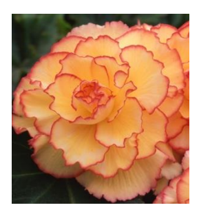
Amerihybrid Sunburst Picottee Begonia tuberosa Shade 12"x12"