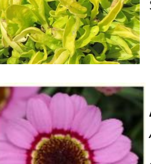
Arygranthemum Pink Halo Argyranthemum frutescens

Sun 12-24" tall. Has more profuse flowering and a larger bloom. Rich pink color, great in the spring.