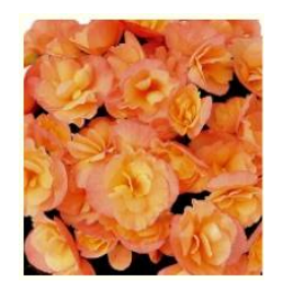
Dragone Sunset Begonia hiemalis

Sun to part shade 12-16" x 16-20". Great plant all year. Likes hot and dry conditions. Prolific bloomer.