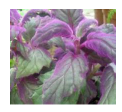
Purple Heart Passion Velvet

Shade or part shade 18" x 12". Velvety leaves.