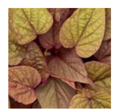
Sweet Heart Red

12" x 30". Lobed leaves remain light green in color, with a trailing habit. Coarse texture helps it to stand apart.