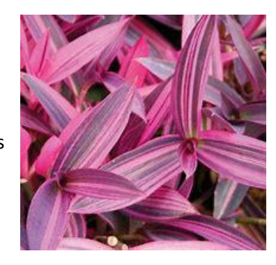
Purple Heart Setcreasea Variegated

Sun to part sun 12" x 15". Distinctive flower shape adds interest to any landscape.