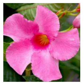
Mandevilla Alice Dupont

Variegated green purple and cream leaves with small pointed purple fruits that mature red.