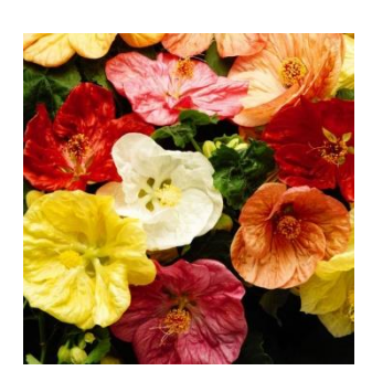
Abutilon Bella Mix Abutilon striatum

Partial sun 14-18" x 15". A bright and unique flower that was a "Made for Shade" selection. Compact and great for color in shade containers.