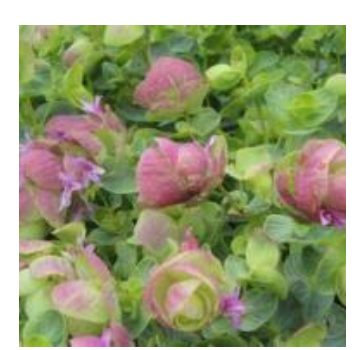
Ornamental Oregano Kirigami

Sun to partial sun 2-10" x 20-26" Features huge double blooms that are great for hanging baskets.