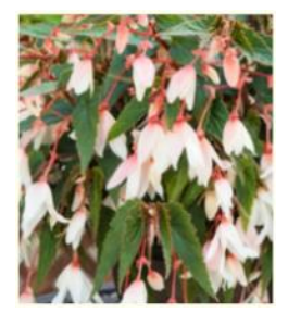
Bossa Nova White

Shade 12" x 9" A subtle but warm color that pairs well with most shade plants.