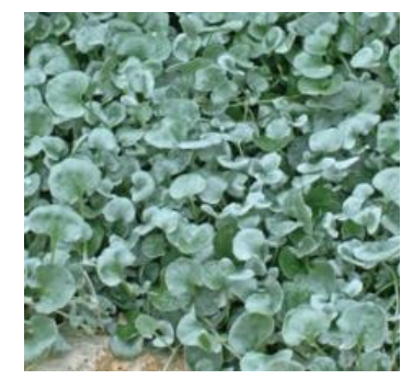
Dichondra Silver Falls

Sun 12" x 12". Deep scarlet petals highlighted by bright yellow petals.