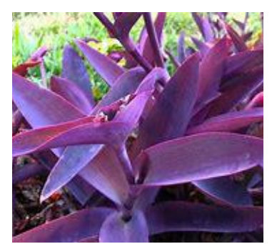
Purple Heart Setcreasea

Shiny flowers with novelty white sparkle pattern.