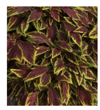
Coleus Le Freak