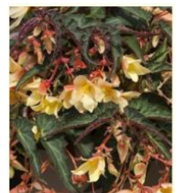
Bossa Nova Yellow

Part shade to shade 12" – 16" tall. Spiral leaves resemble snail shells.