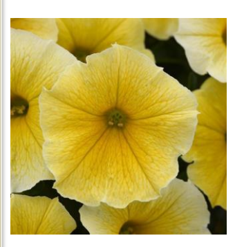
Petunia Bee's Knees