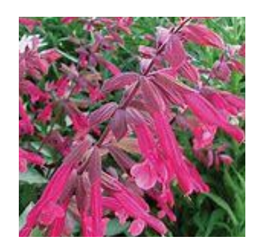
Salvia Wendy's Wish

Part sun or part shade 15" x 8". Great yellow vine for containers or hanging baskets.