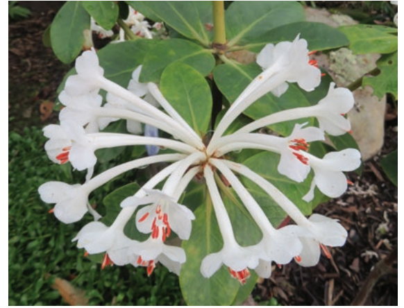
Rhododendron goodenoughii - Named after the Island in New Guinea from which it was collected.

For the next few years a number of initiatives are planned. A hiking and biking trail through Pukeiti, and then around the Kaitake Ranges to Oakura, is planned to be completed by 2022. Preceding this, next year a walking track along the old tramline on which logs were transported to the mill in the early 1900s will be further developed, and in 2021 a suspension bridge, the longest in New Zealand, will give outstanding views of the rainforest canopy and be an added attraction in itself. Also a stylishly designed family hut which will sleep 12 hikers is being constructed along the walkway on Pukeiti Hill.