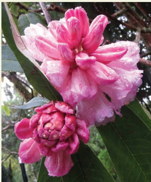
The buds of an unnamed hybrid R. 'Ina Hair' x R. protistum