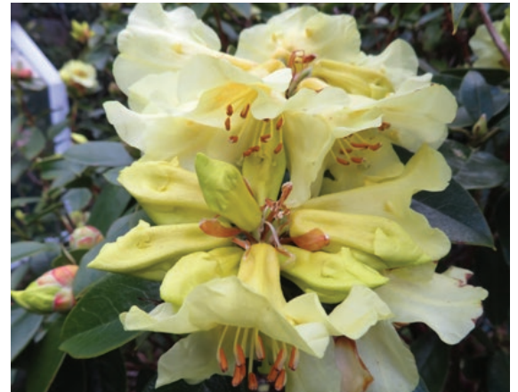
Rhododendron 'Chrysomanicum' - A hybrid of R. chrysodoron and R. burmanicum raised in Bodnant, Wales. Awarded an A.M in 1947