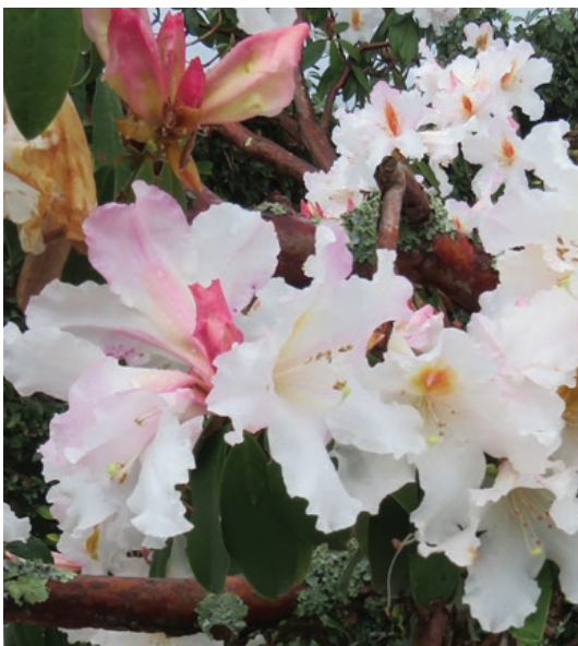
R. cubittii now included in the Cubittii group within the species Rhododendron veitchianum

The three photos are all of August flowering rhododendrons