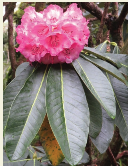
R. 'Jack Anderson'