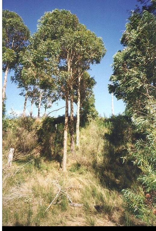
Eucalyptus microcorys (tallow wood) being trialled by a farm forestry enthusiast

The high ringplain area can be considered to include areas above Inglewood, around the Wiremu Road, and other similar altitudes that experience higher than average rainfall and colder temperatures. Species suited