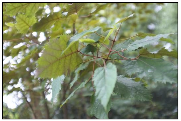
Aristotelia serrata at Underway Gardens, West Porlock

There is one national flora where broadleaved evergreen trees often retain a gamut of purples and reds. In New Zealand, the largest herbivores were not mammals but giant flightless moas which, presumably, had better colour vision and might overlook a tree that wasn't the anticipated green. Many of these species also have leaves whose shape alters wildly as the tree matures (and gets out of moa reach). Pseudopanax