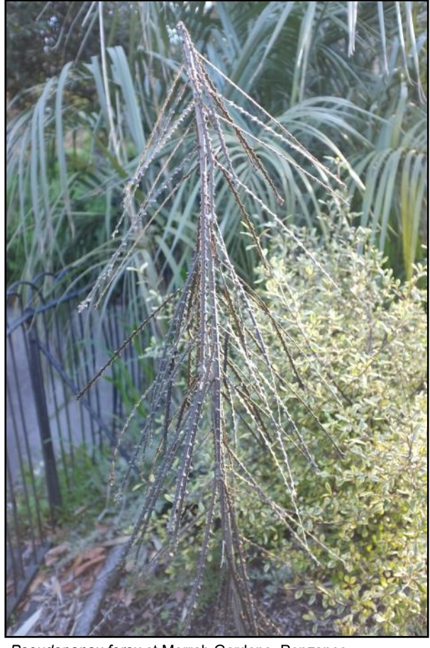
Pseudopanax ferox at Morrab Gardens, Penzance

ferox goes through a teenage punk stage when it seems to be brandishing serrated bloodstained cutlasses.