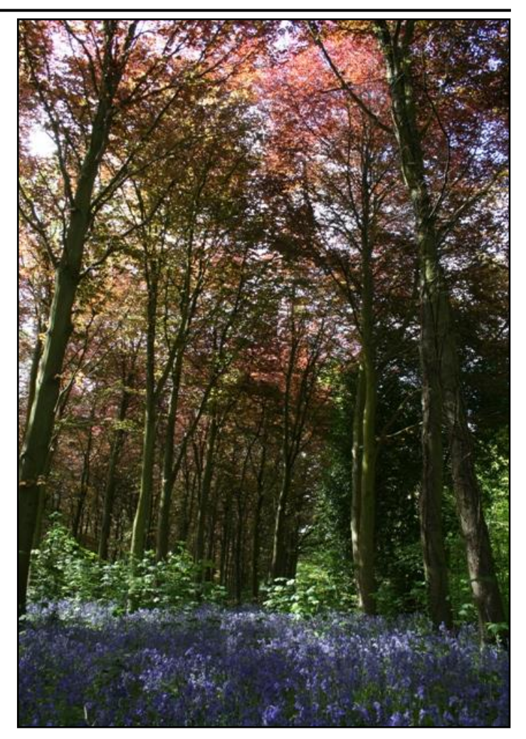
A bluebell wood of Copper Beech near Cambridge

Sports which flush royal purple, and fade to muddy green, are more numerous and can offer a piquant palette of colours as the season unfolds. These, too, can be vigorous trees: the champion Acer platanoides 'Schwedleri' at Darley Park in Derby had a girth of