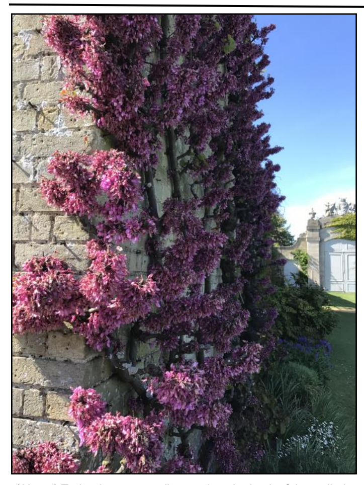
(Above) Trained as an espalier, against the back of the walled garden, this Judas Tree (Cercis siliquastrum) is probably over 100 years old and is still meticulously pruned to produce this stunning show of flowers each May. (Above right) Wrest Park House, from the Long Canal towards the south front. (Right) Jeffrey Pine ( Pinus jeffreyi ) a county champion!