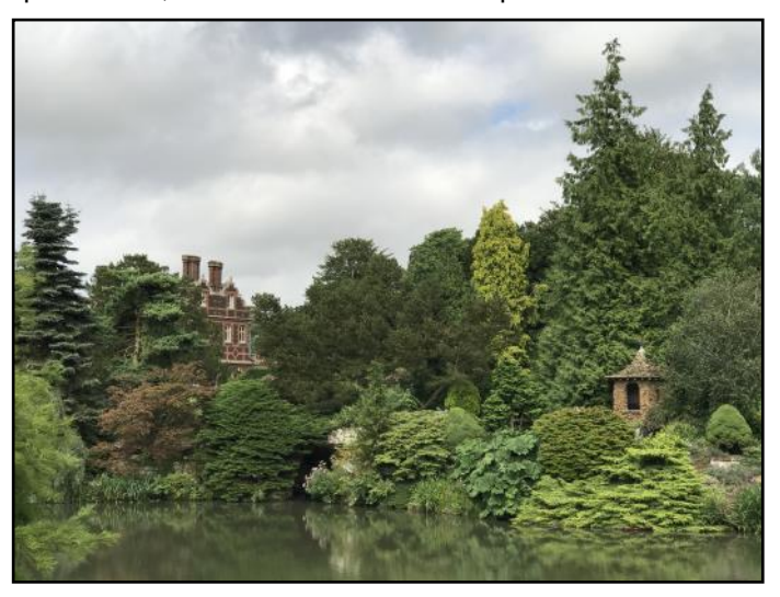
View looking northeast across the upper lake, towards the rockery and Sandringham House beyond. See also the newsletter front cover.

After the comfort of the tearoom and a fresh baked scone, I headed towards the West Lawns and the lake. My stop had allowed me time to login to our website on my smartphone and find that a number of Norfolk champions could be found on the rockery by the upper lake. These included the slow growing Pinus mugo , Pinus sylvestris 'Aurea' and the brightly conspicuous golden elm, that I spotted far more easily than I could pronounce, Ulmus x hollandica 'Dampieri Aurea'.