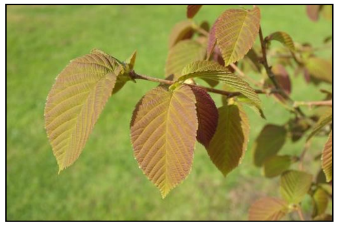
Corylus chinensis at Bluebell Arboretum, Derbyshire

The Bluebell Arboretum in Derbyshire in May is a good place to admire many of these new clones, such as Liquidambar acalycina 'Burgundy Flush' and Cercidiphyllum japonicum 'Strawberry', along with dawn -sky loveliness of the unfurling leaves of Corylus chinensis or Tilia endochrysea.