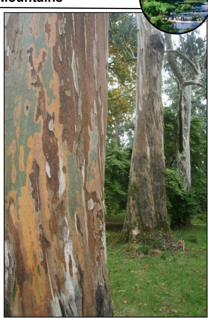
The Eucalyptus Grove includes, Eucalyptus viminalis , planted in 1911, and now champions of Britain and Ireland at over 40m in height.

Thomas Walpole, a son of the founder, Edward. Until they were built, the river virtually dried out during dry summers. We know we are totally prejudiced but we feel it is a very special garden which should be experienced and enjoyed by everyone.