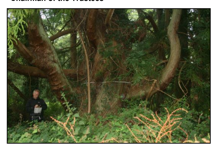
Ireland's principal tree recorder, Aubrey Fennell, amongst the massive branches of a Japanese Red Cedar (Cryptomeria japonica) at Curraghmore House, Co. Waterford.