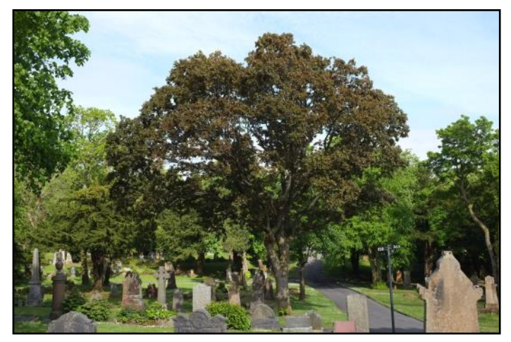
Quercus robur 'Purpurascens' at Greenock Cemetery

In springtime when sunlight shines through the translucent young foliage of a Copper Beech, they, and the best clones of the Japanese Acer palmatum, offer perhaps the purest of purple tree experiences. The rest can turn some distinctly dodgy colours. The purple Honey-Locust (Gleditsia triacanthos 'Rubylace') goes a bizarre sort of muddy brown, though fortunately on a much smaller scale (6m x 70cm girth this year for a new champion, in front of the flats in Duke Street in central Taunton). The Purple Sycamore (Acer pseudoplatanus Purpureum Group) is also brown when you see the sun through it but in more refreshing shades - the leaves are deep green on top, and bright mauve underneath. The common clone (which includes the champion, 25m x 460cm in 2014 in Bath's Henrietta Park) confusingly, and uniquely, starts green in April and only reddens through the following weeks.